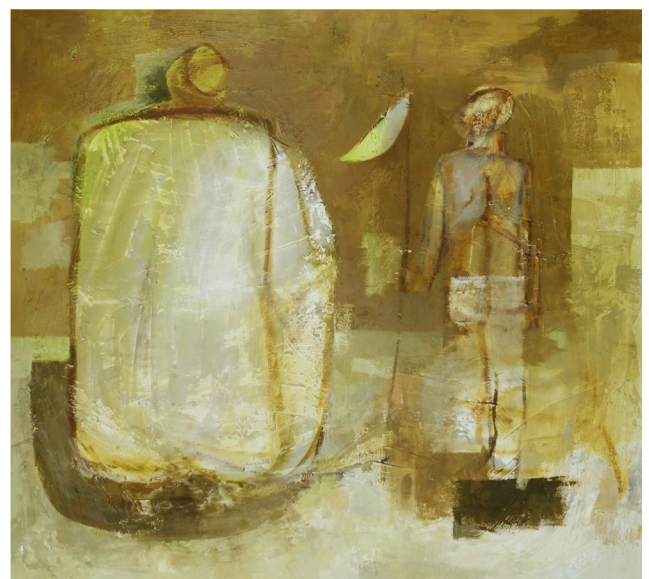
The Boy With a Fishing Net | Oil on canvas | 152 x 170 cm (60 x 70 in) | 2013