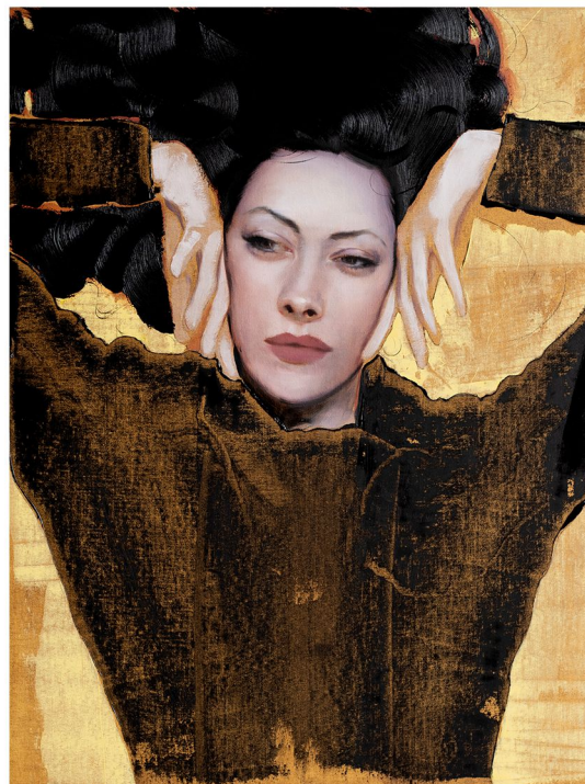
Untitled 3 | 2020 | Oil on cradled linen panel | 101.6 x 76.2 cm