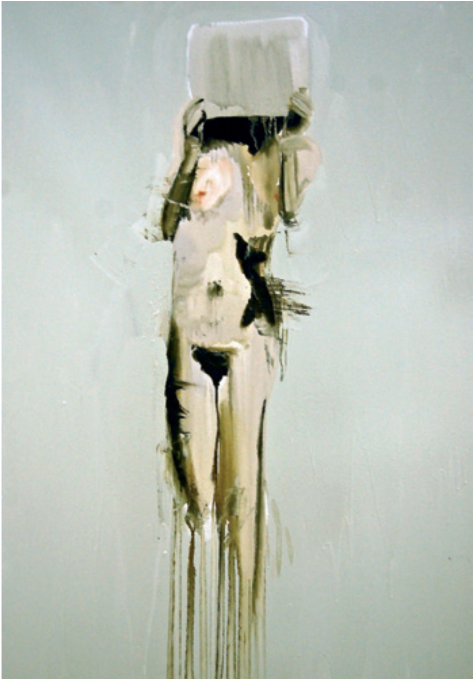
Female Nude II Oil and gloss on canvas, 150 x 120 cm, 2011