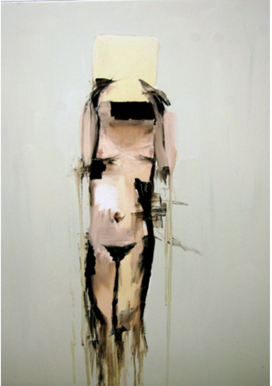
Untitled V Oil and gloss on canvas, 150 x 120 cm, 2011