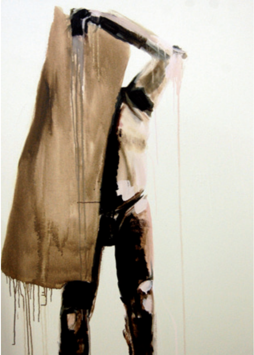
Untitled Male Oil and gloss on canvas, 120 x 90 cm, 2011