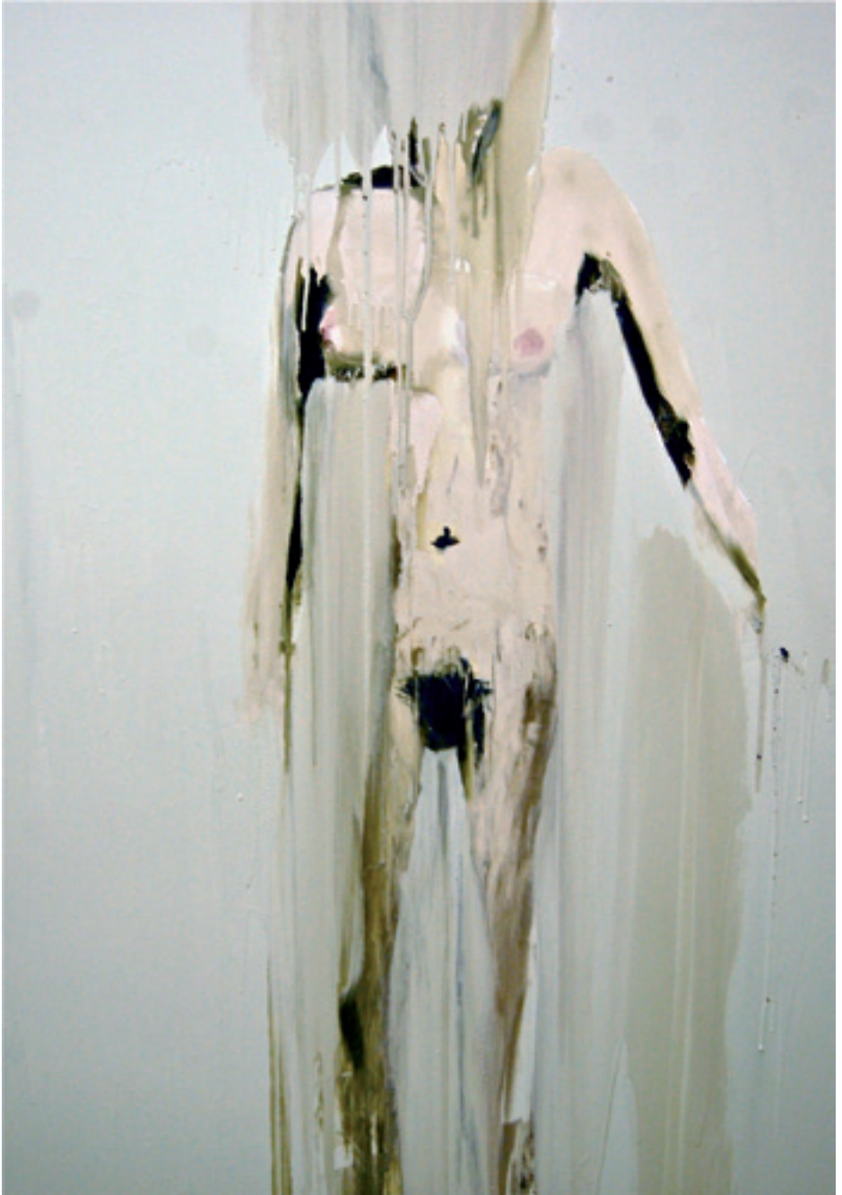
Female Nude I Oil and gloss on canvas, 150 x 120 cm, 2011