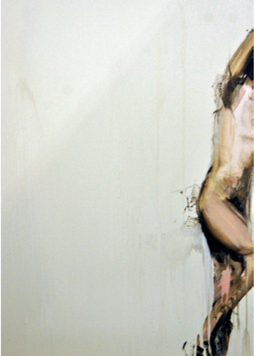
Untitled Male Nude Oil and gloss on canvas, 120 x 90 cm, 2011