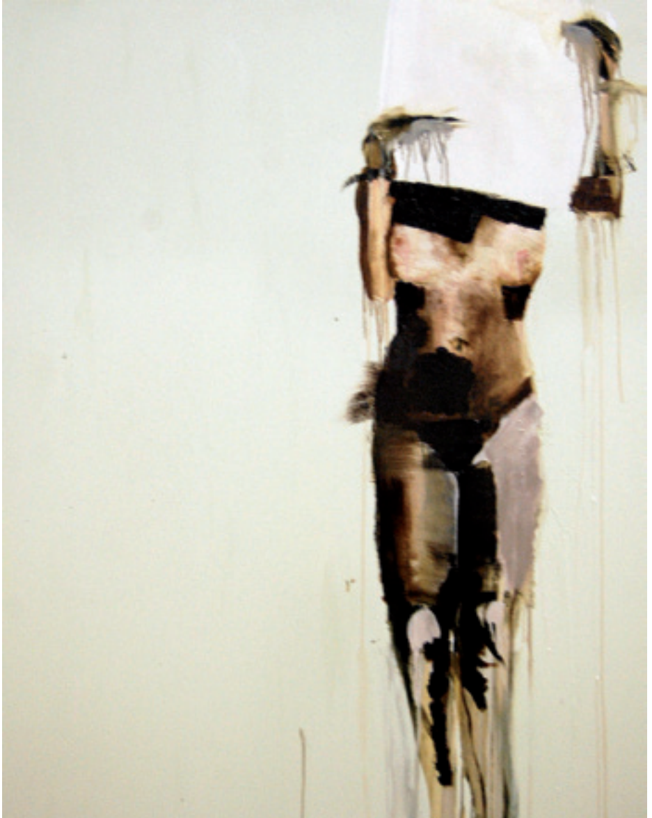
Untitled II Oil and gloss on canvas, 150 x 120 cm, 2011