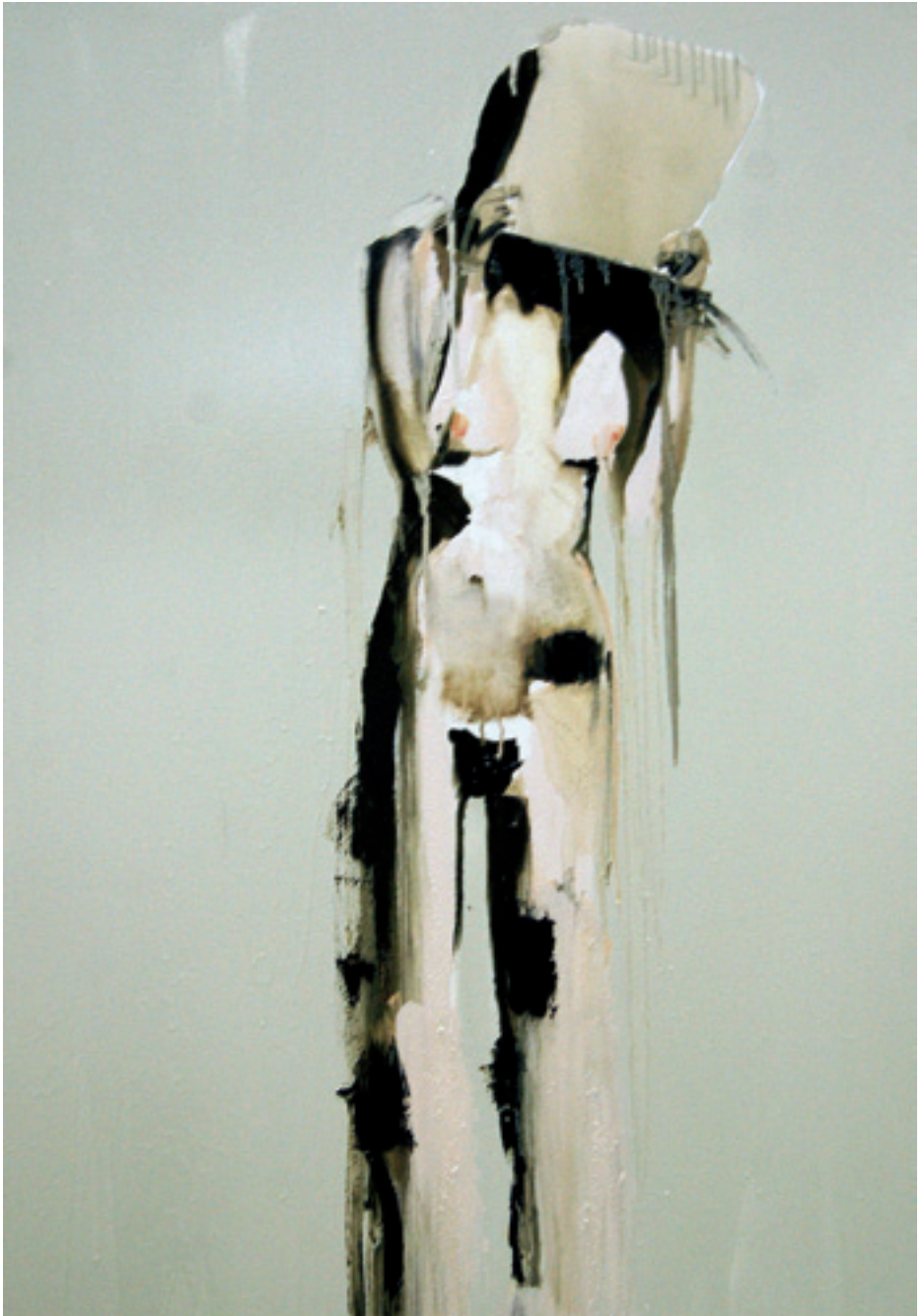
Female Nude IV Oil and gloss on canvas, 150 x 120 cm, 2011