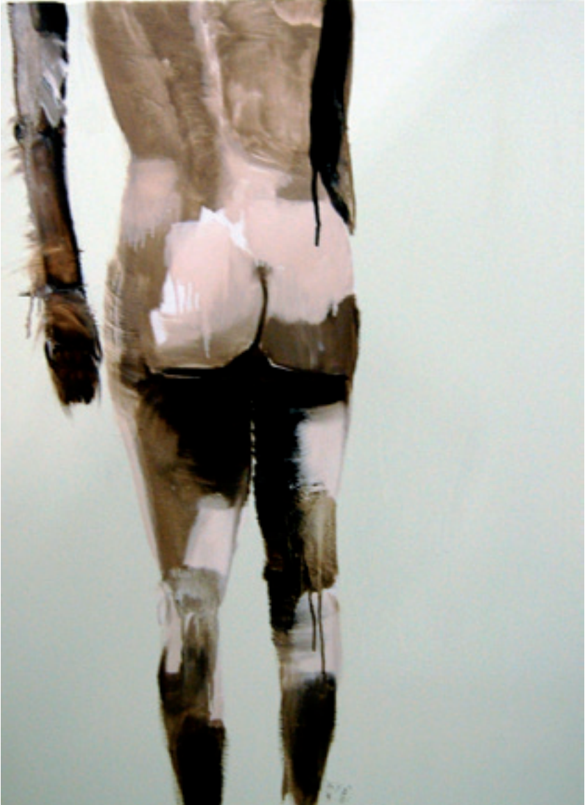
Untitled IV Oil and gloss on canvas, 120 x 90 cm, 2011