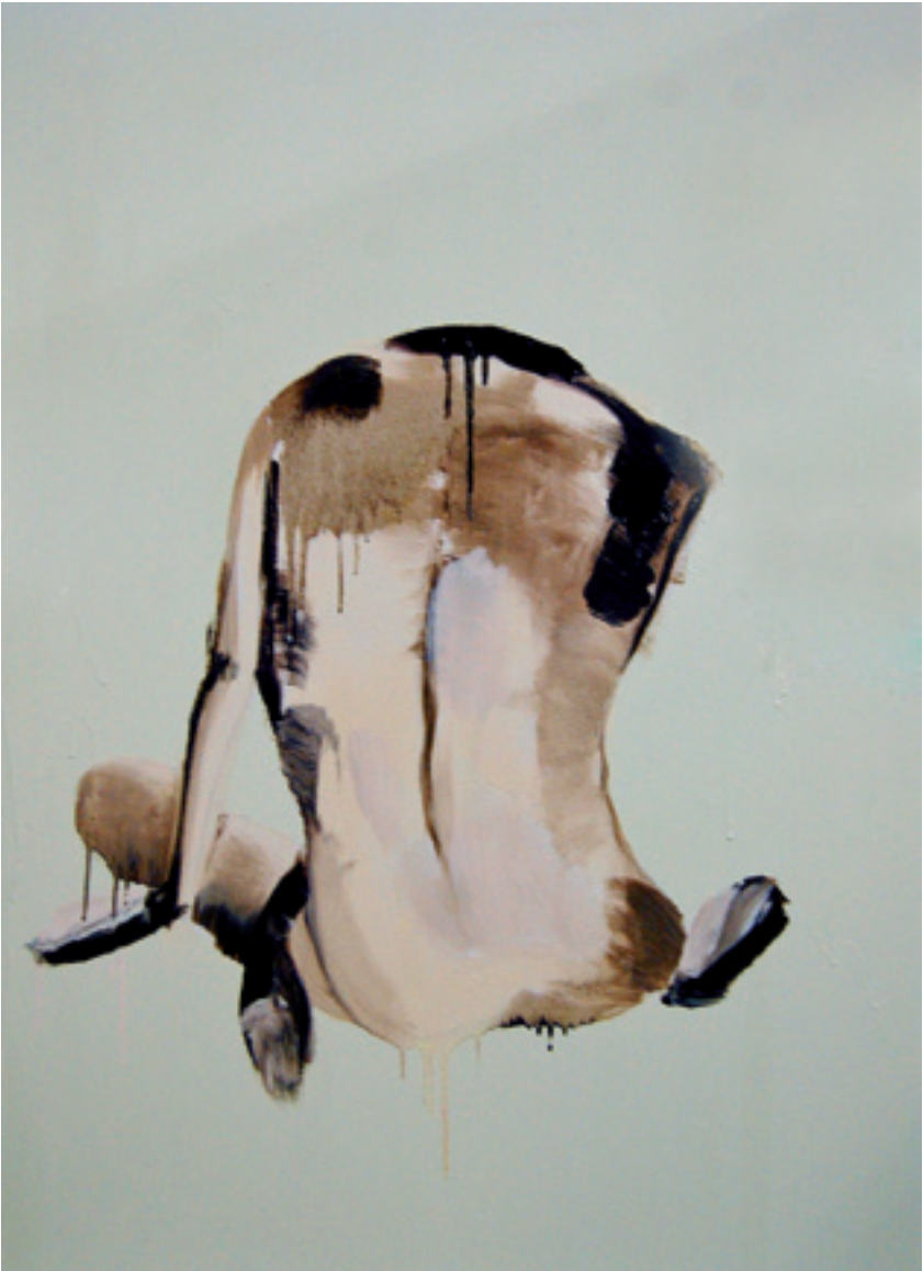
Untitled III Oil and gloss on canvas, 120 x 90 cm, 2011