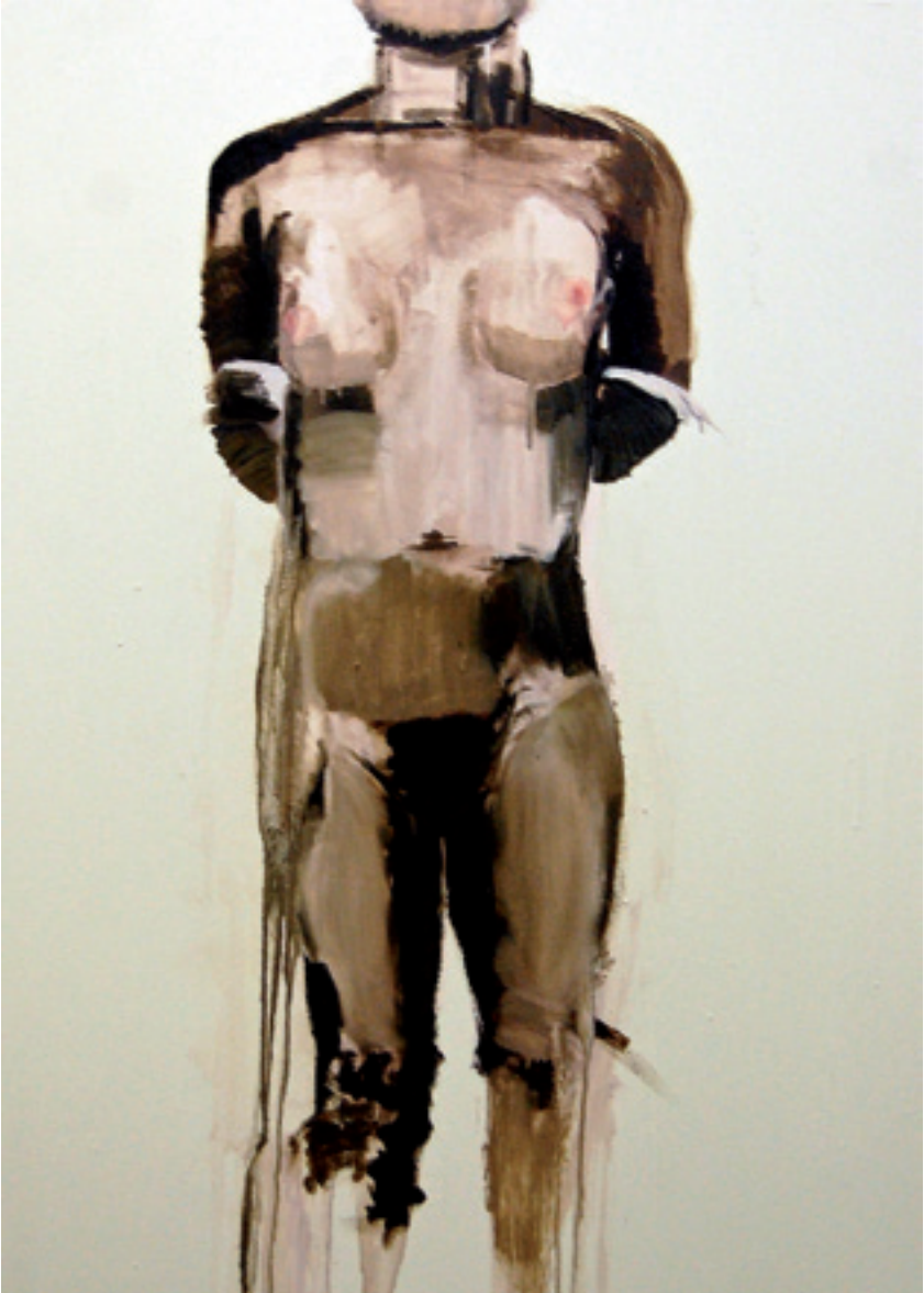
Untitled I Oil and gloss on canvas, 120 x 90 cm, 2011