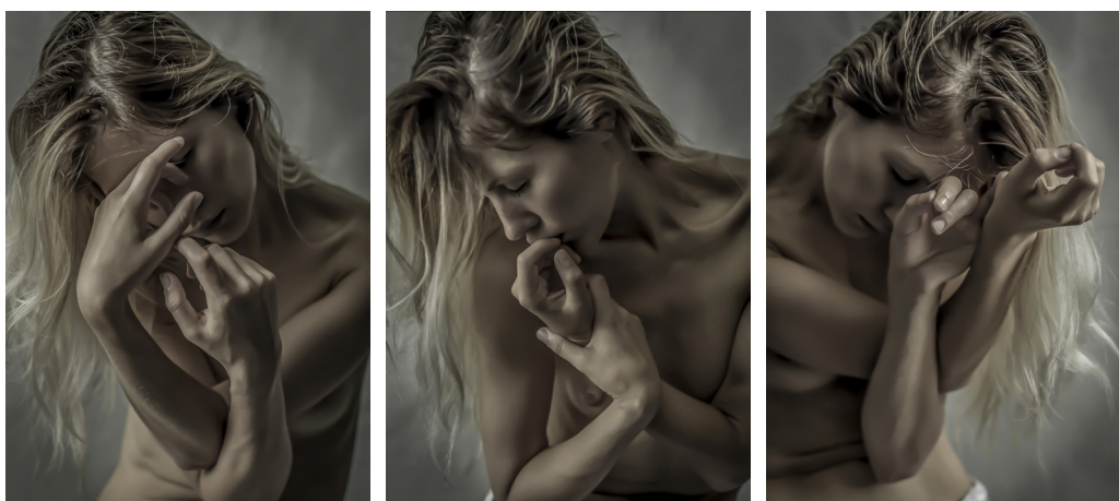
Two Hands #2 (i) (ii) (iii) 2017 | Lenticular photographs, Ed. of 12 | 78 x 59 cm (31 x 23 in) each