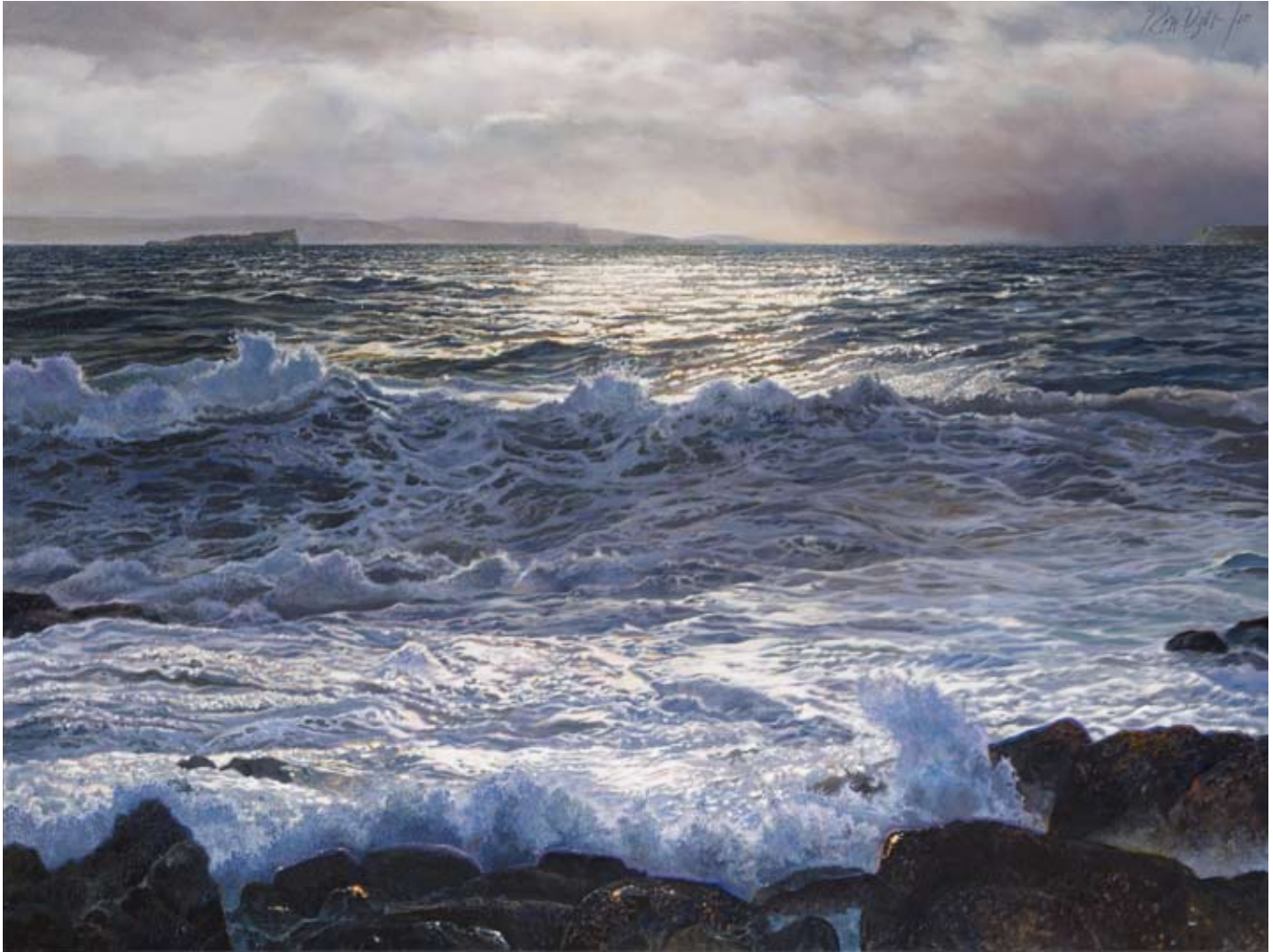
6 Runkerry Twilight oil on canvas 84 x 112 cm (33 x 44 in)