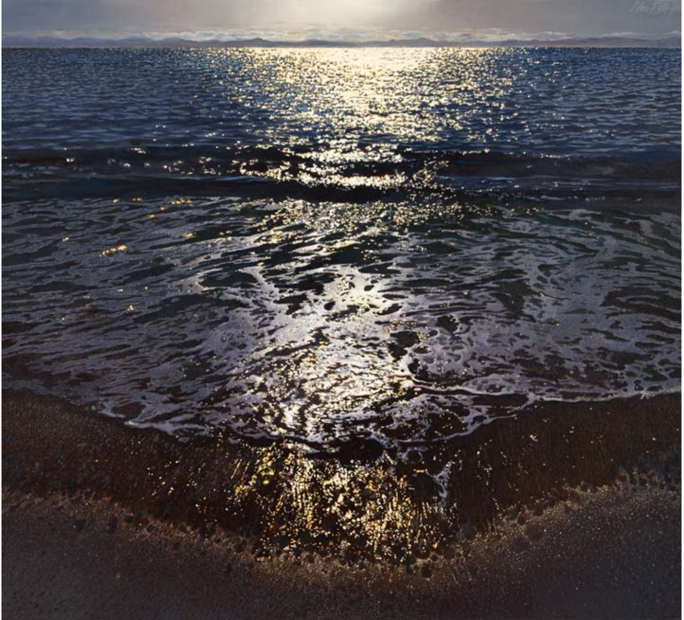
7 A Flash of Gold oil on canvas 107 x 117 cm (42 x 46 in)