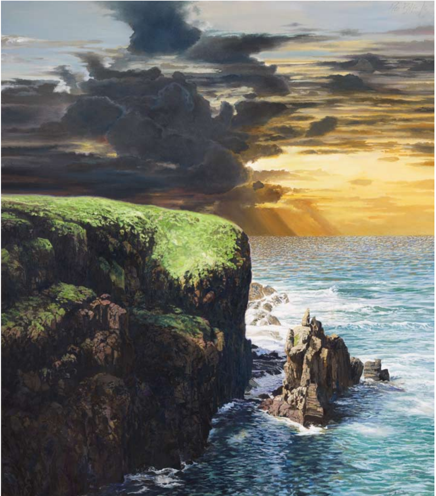
10 Goldlight - Antrim oil on canvas 117 x 102 cm (46 x 40 in)