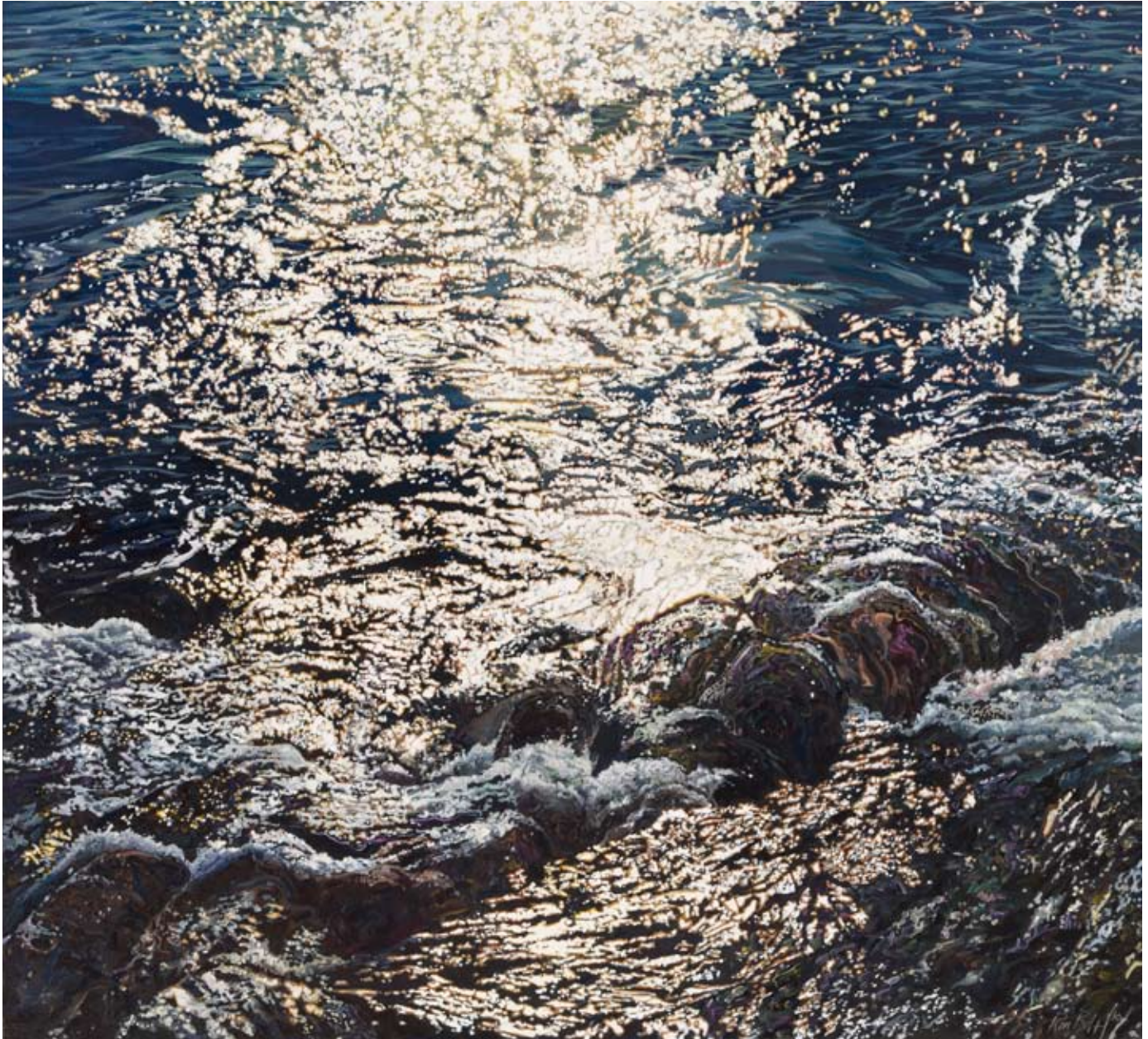
3 Dazzlerazzle oil on canvas 107 x 117 cm (42 x 46 in)