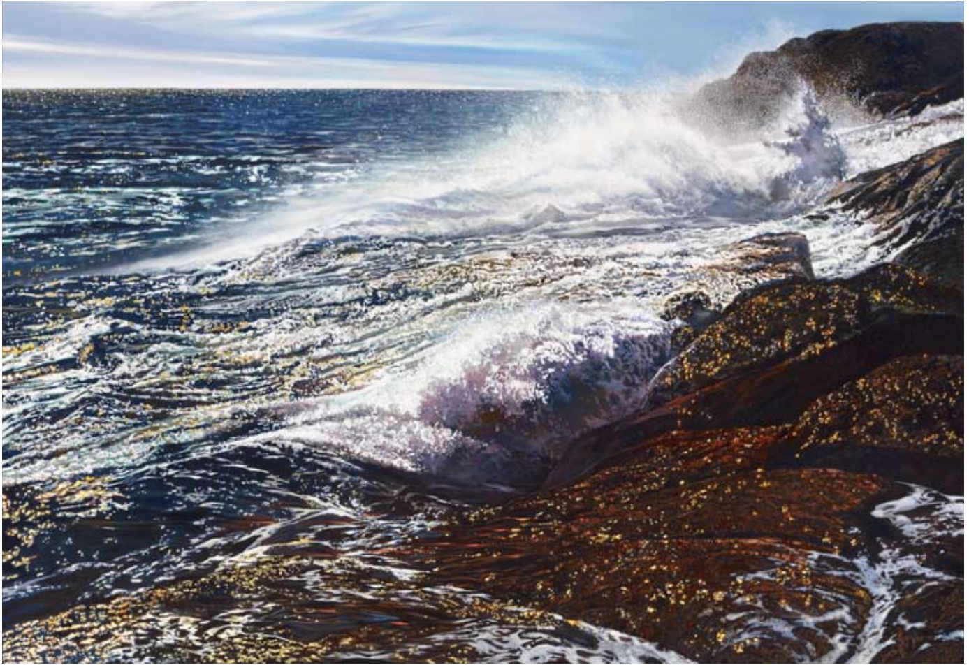
2 Cold, Bright and Clear oil on canvas 92 x 132 cm (36 x 52 in)