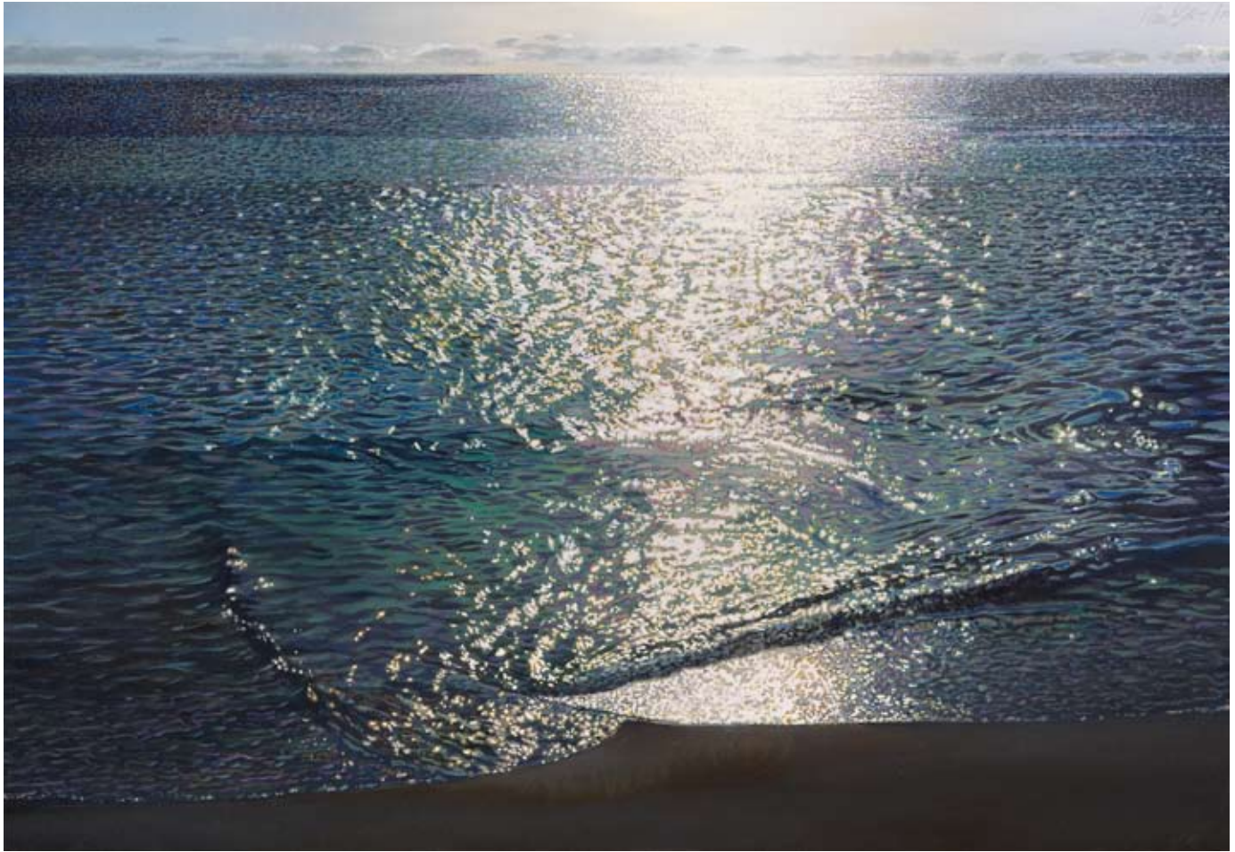
9 Flashdance South oil on canvas 92 x 132 cm (36 x 52 in)