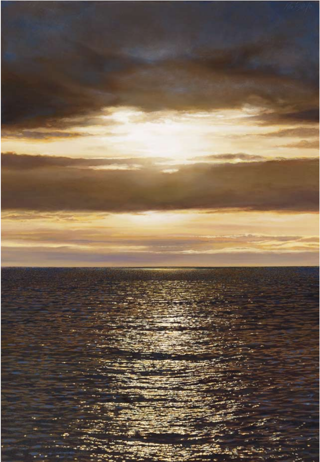
12 Descending Night - Antrim oil on canvas 132 x 92 cm (52 x 36 in)