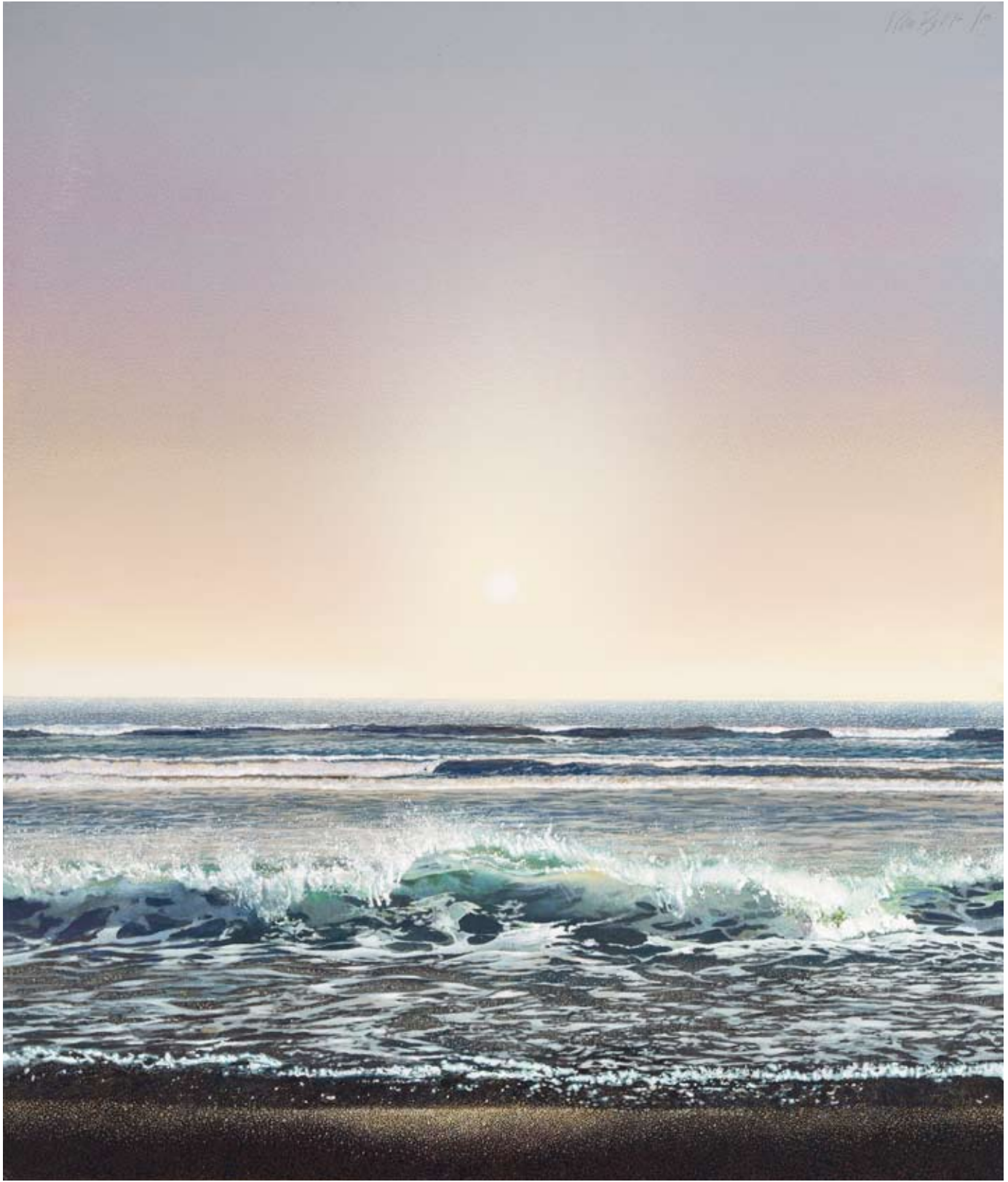
5 Dayspring Two - Pacific oil on canvas 117 x 99 cm (46 x 39 in)