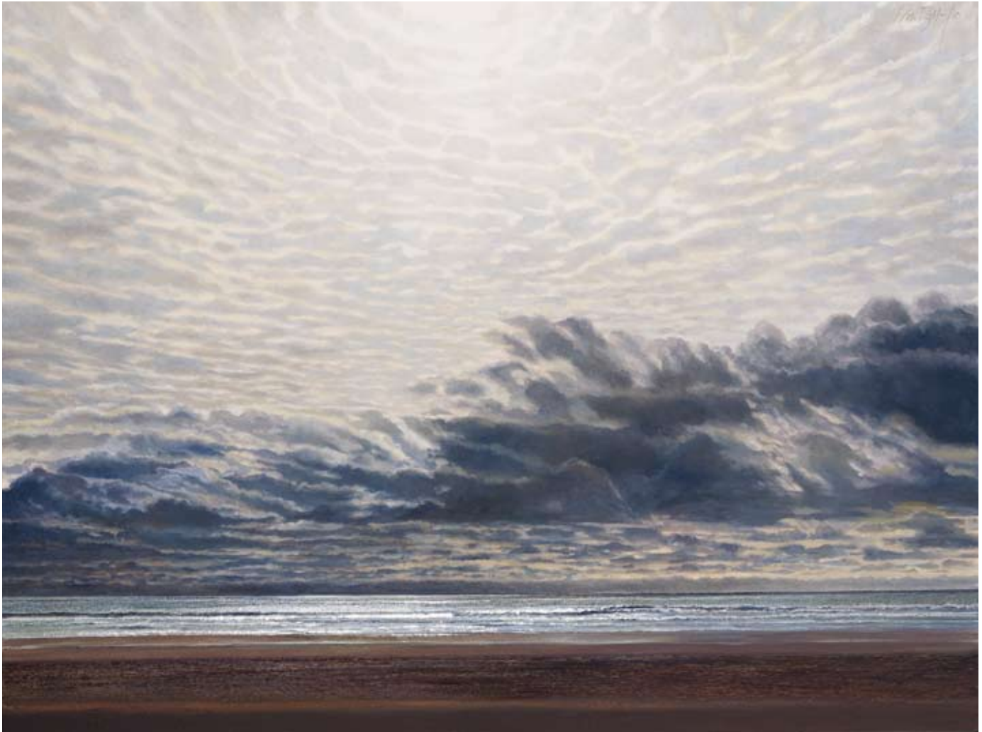
4 A Listening Place oil on canvas 84 x 112 cm (33 x 44 in)