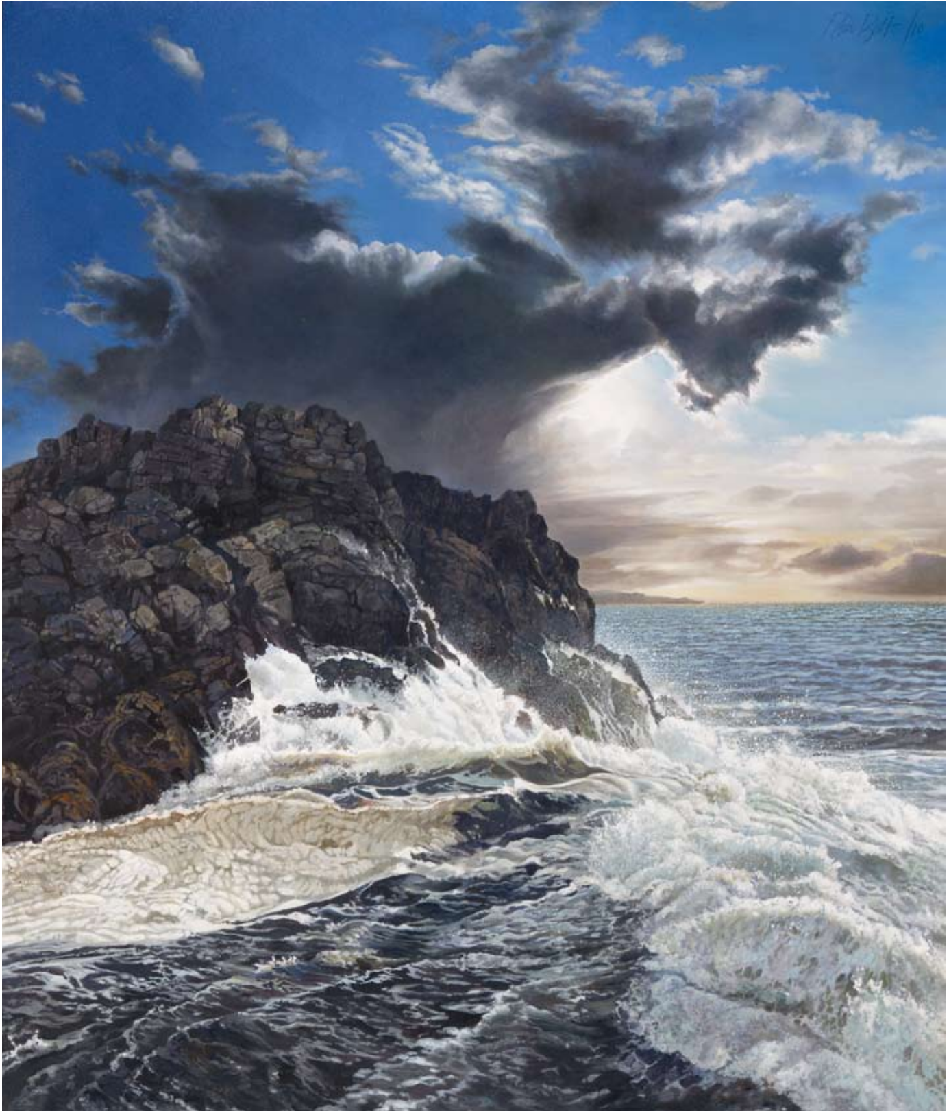
1 Sundown at Black Rock oil on canvas 117 x 99 cm (46 x 39 in)