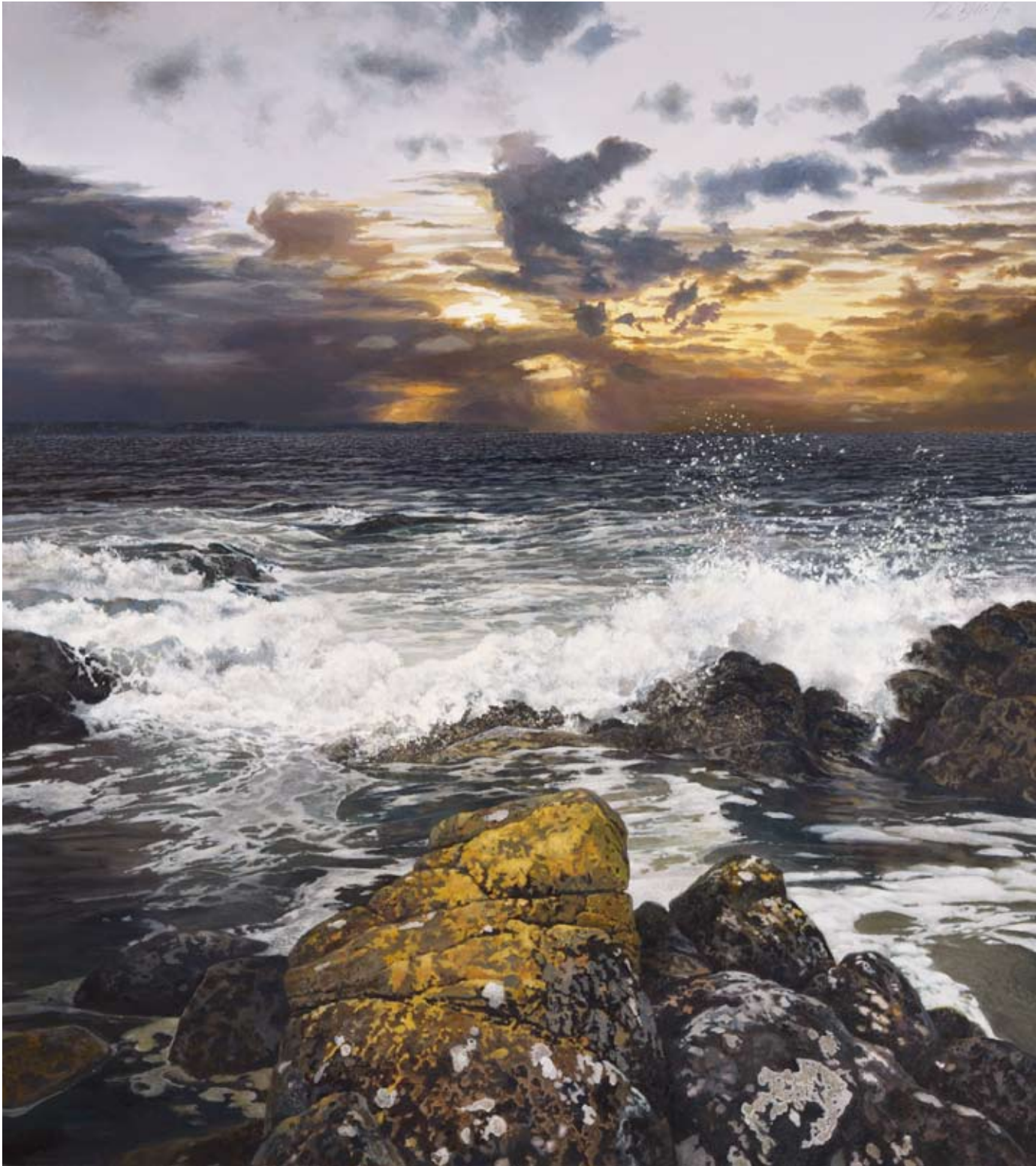
8 Tidal Surge - Antrim oil on canvas 117 x 104 cm (46 x 41 in)