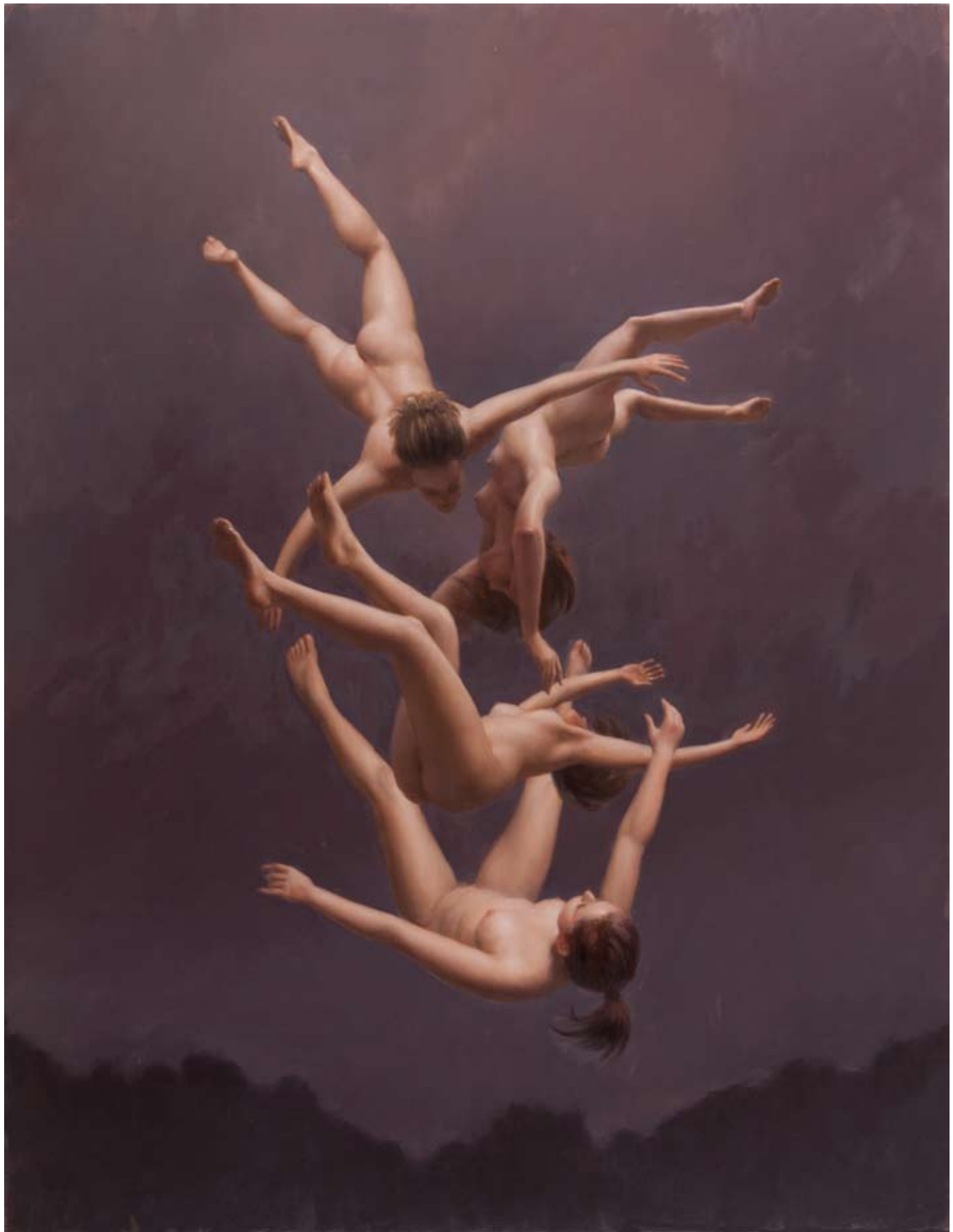
13 Falling II oil on canvas 112 x 86 cm (44 x 34 in)