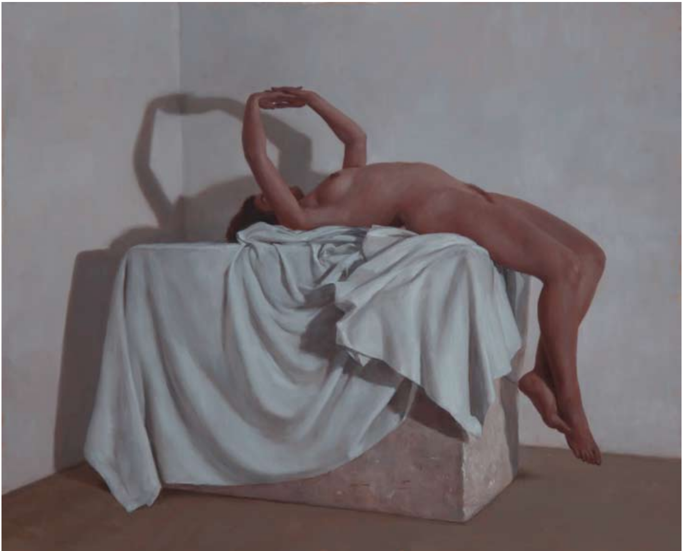
8 Ring oil on canvas 51 x 61 cm (20 x 24 in)