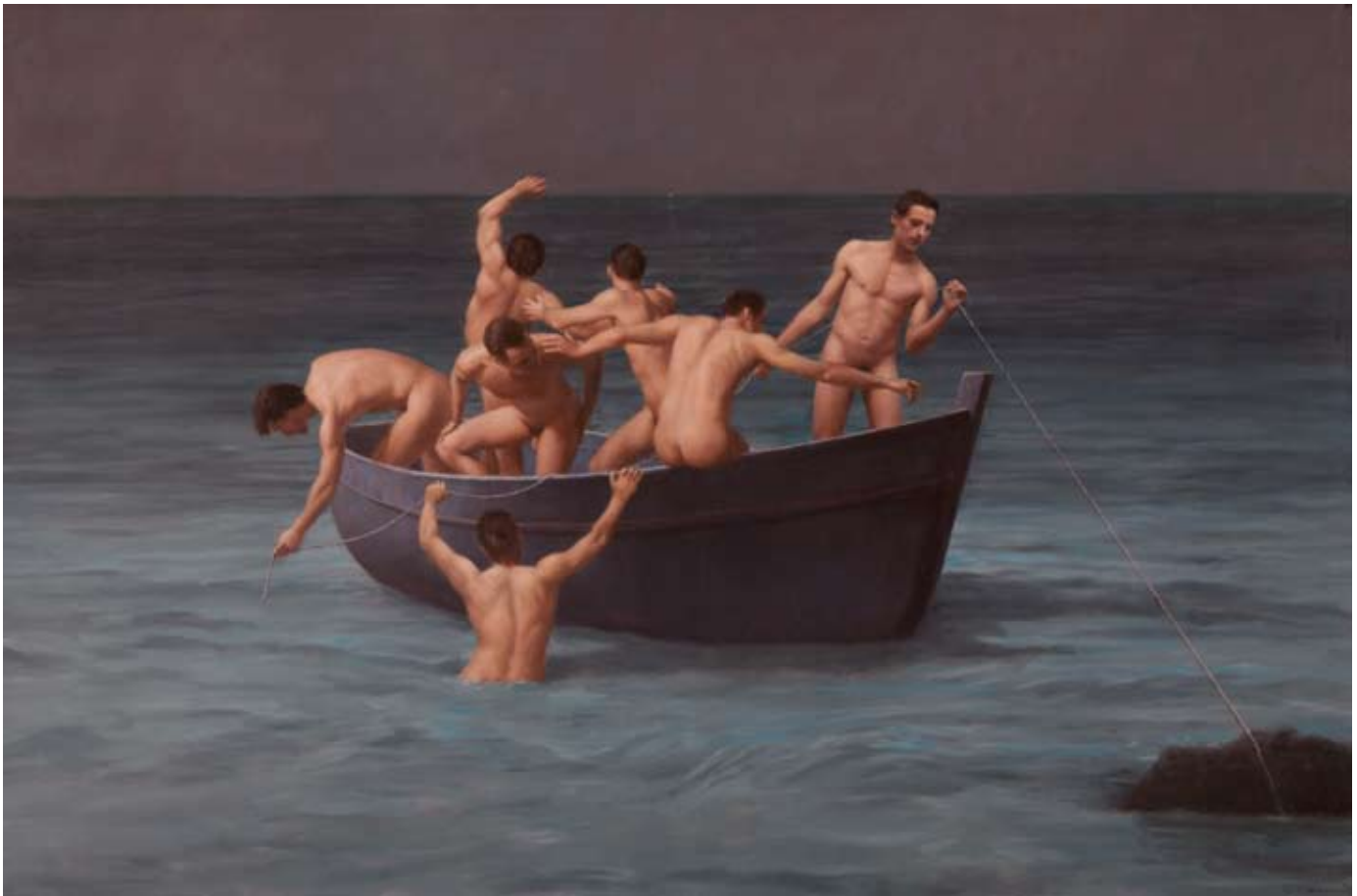
2 Boat Men oil on canvas 71 x 112 cm (28 x 44 in)