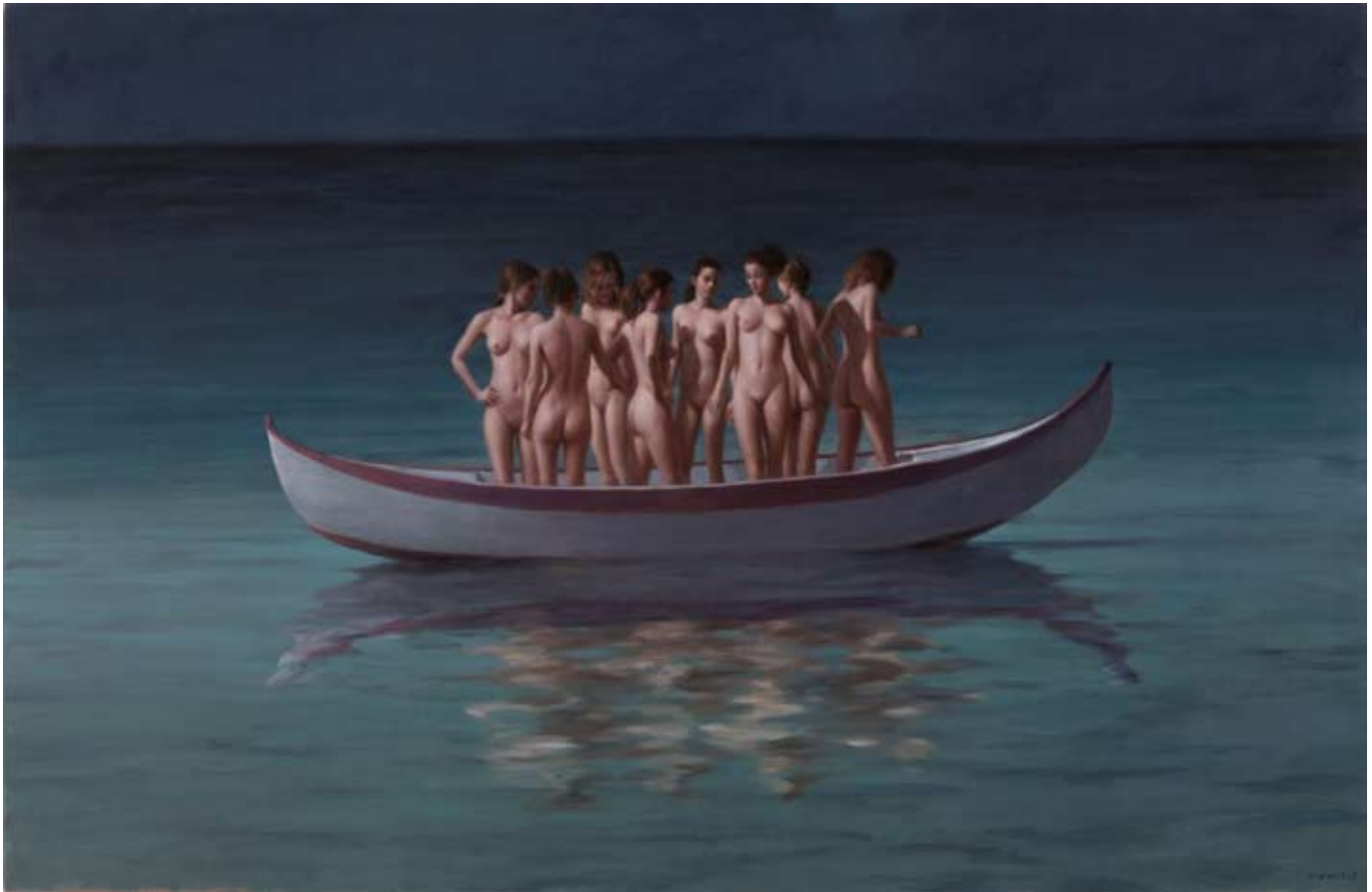
10 Boat Eight oil on canvas 76 x 117 cm (30 x 46 in)