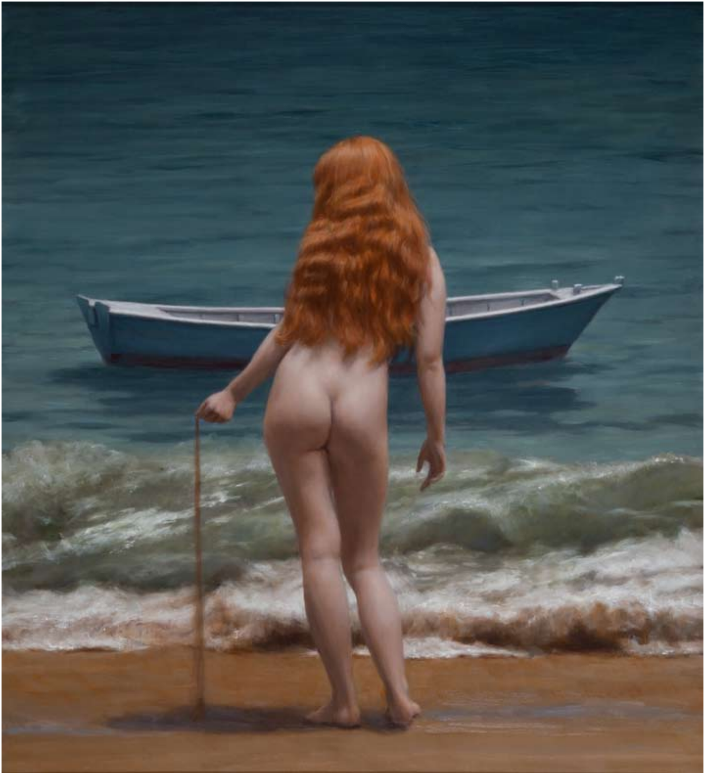
7 Beach oil on canvas 76 x 66 cm (30 x 26 in)