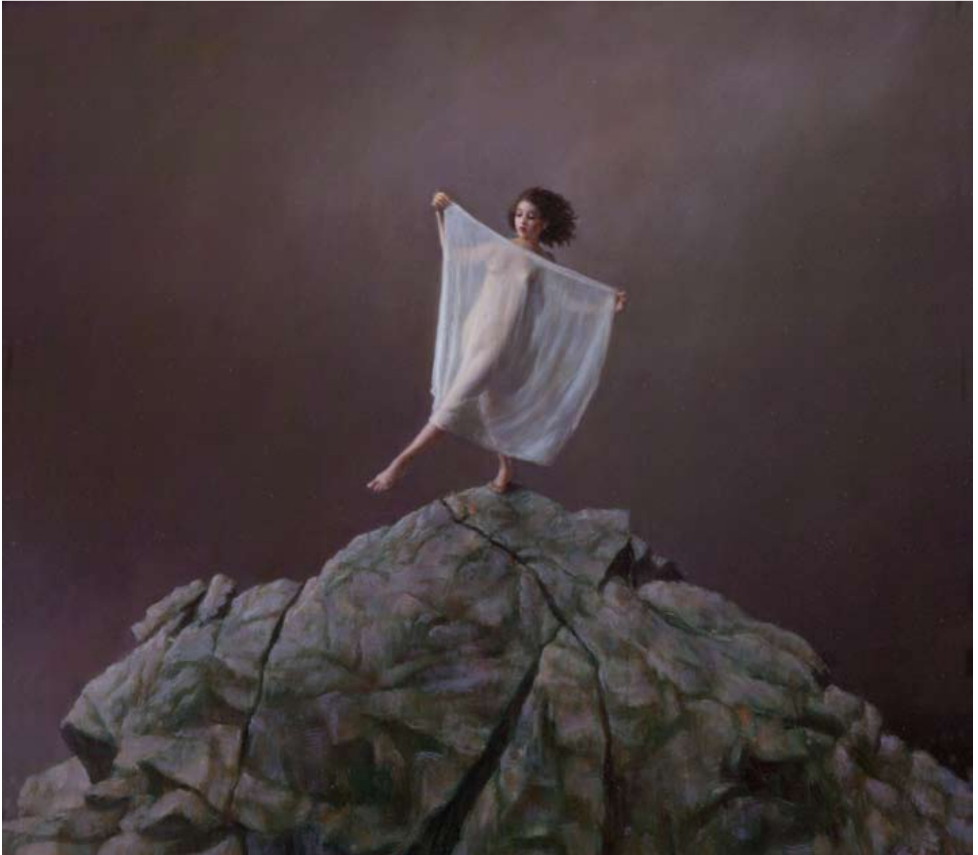
11 Veil oil on canvas 43 x 38 cm (17 x 15 in)