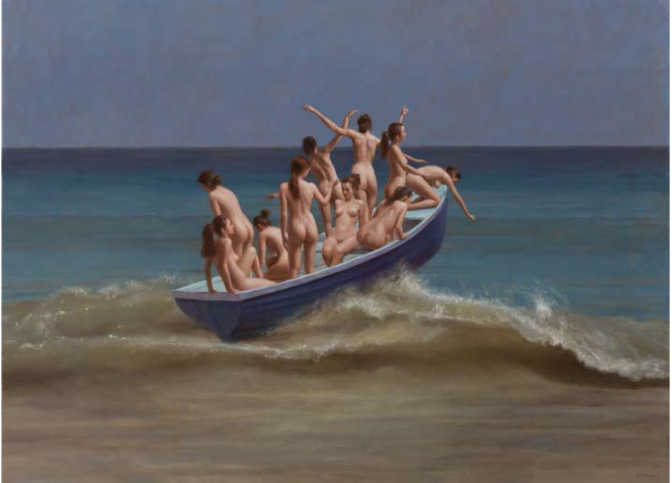
6 Boat Ten oil on canvas 89 x 122 cm (35 x 48 in)