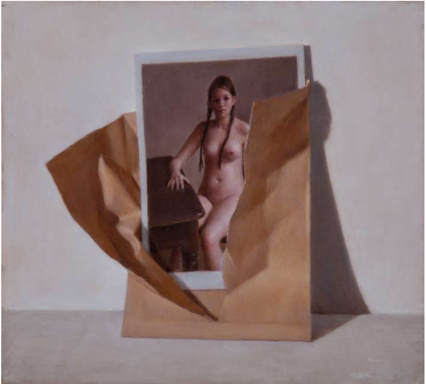
3 Envelope oil on canvas 23 x 25 cm (9 x 10 in)