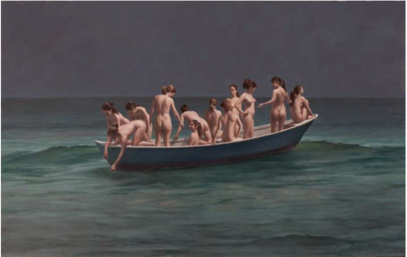
4 Boat Twelve oil on canvas 76 x 122 cm (30 x 48 in)