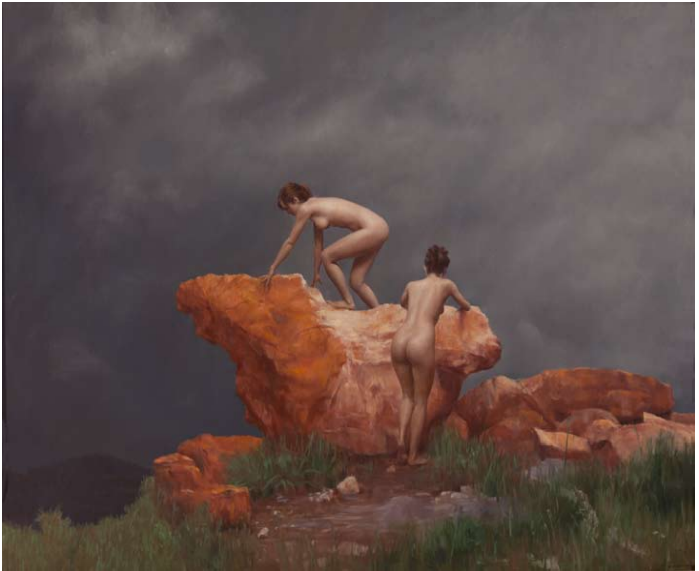
12 Red Rock oil on canvas 89 x 112 cm (35 x 44 in)