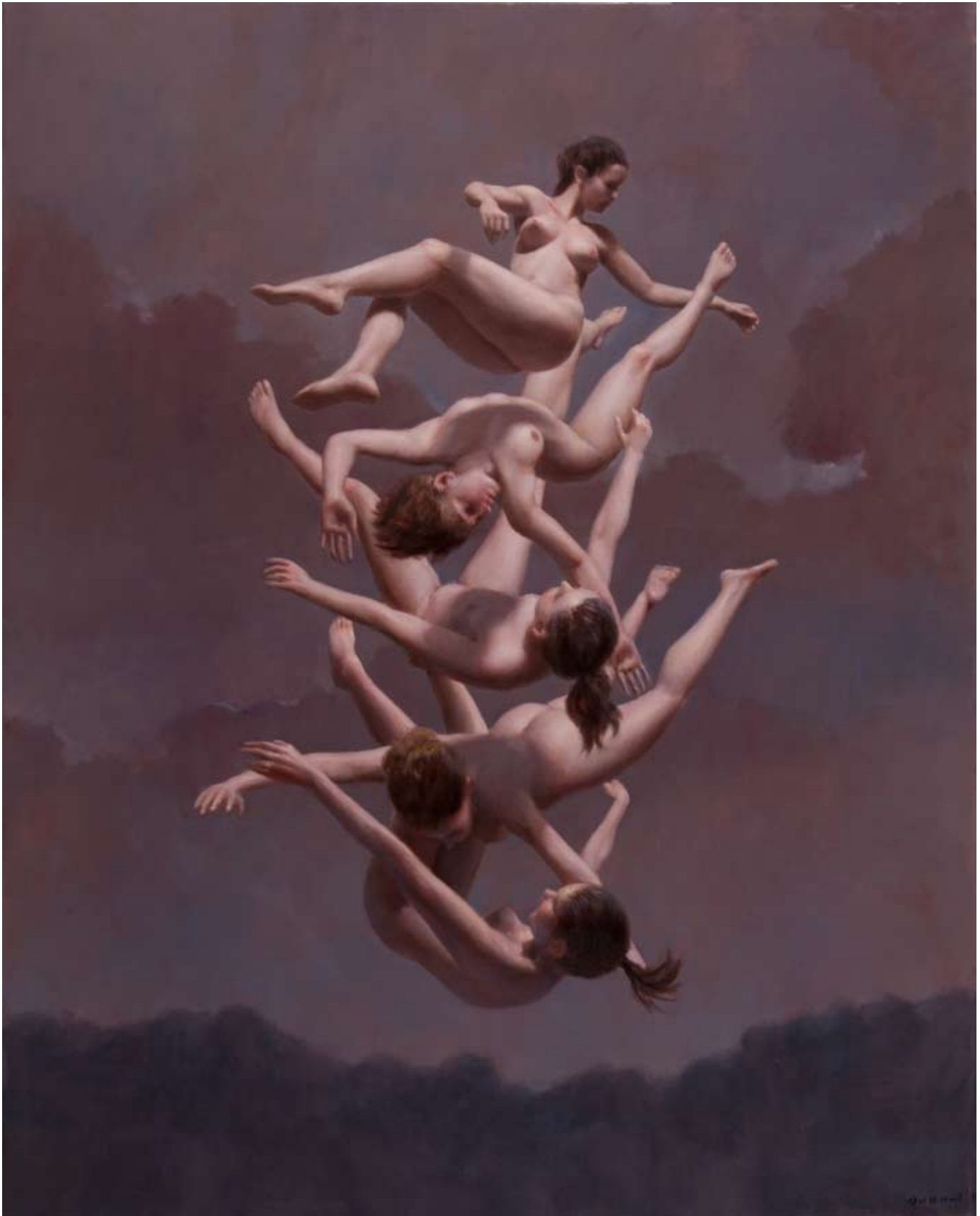
1 Falling oil on canvas 102 x 81 cm (40 x 32 in)