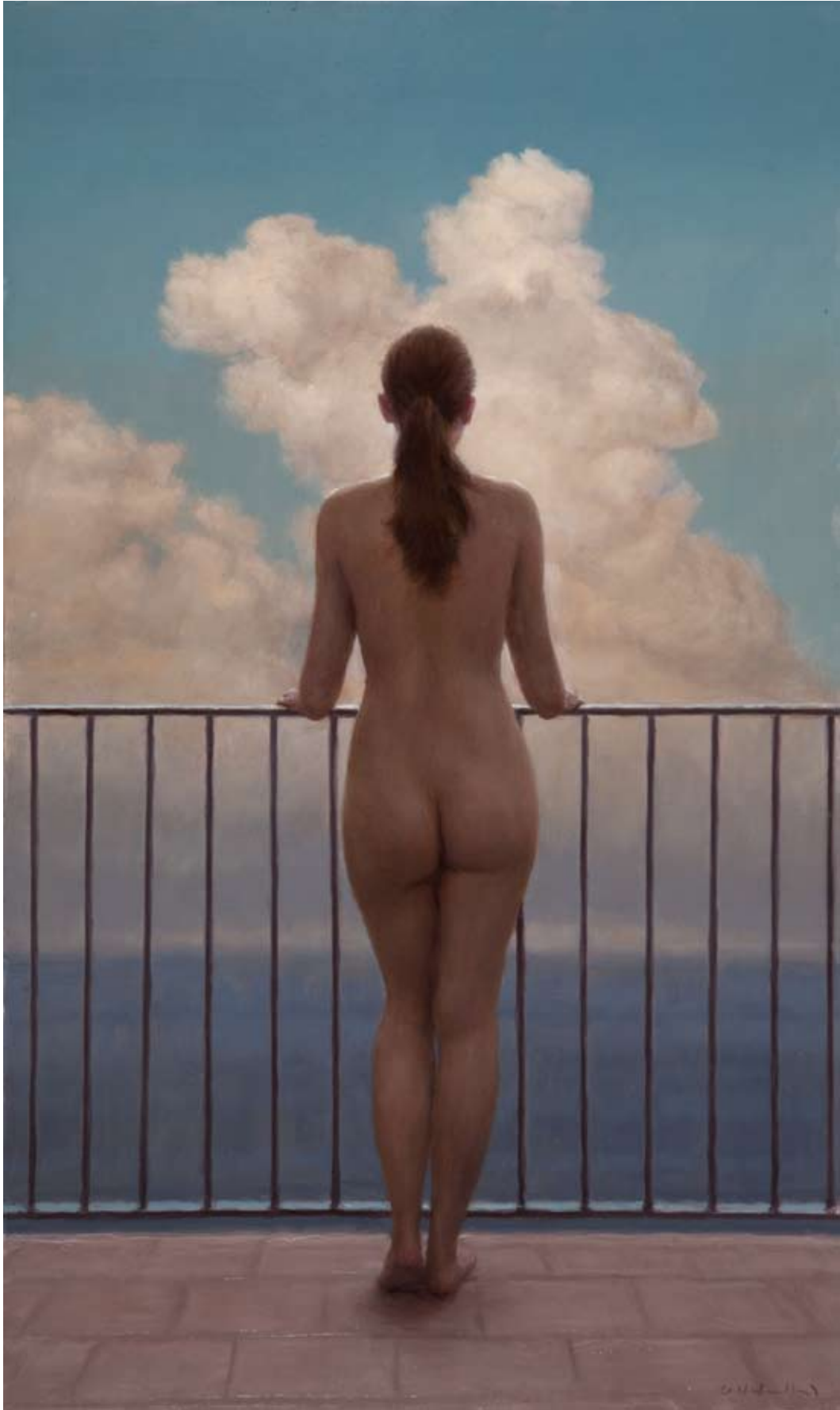
5 Balcony oil on canvas 51 x 30 cm (20 x 12 in)