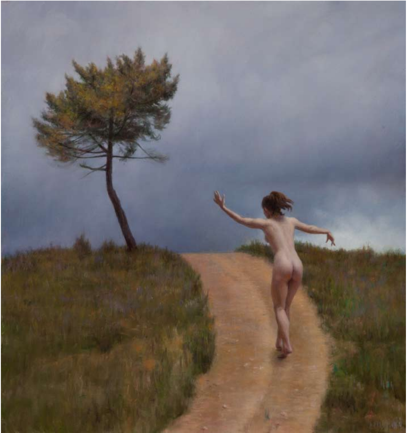
14 Track oil on canvas 46 x 43 cm (18 x 17 in)