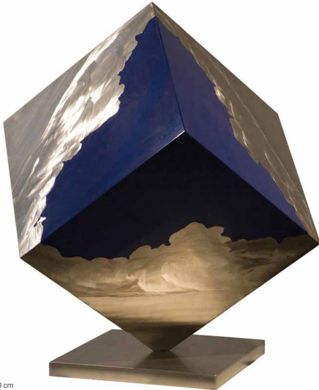
7 Cubic Sky 11003 stainless steel 43 x 40 x 40 cm