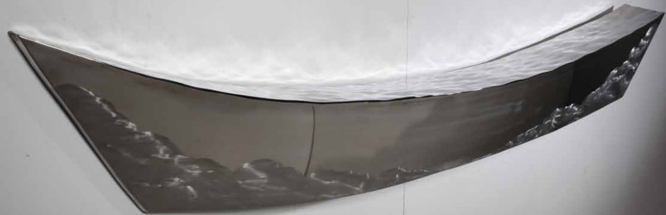
9 Blue 11001 stainless steel 40 x 160 x 17 cm