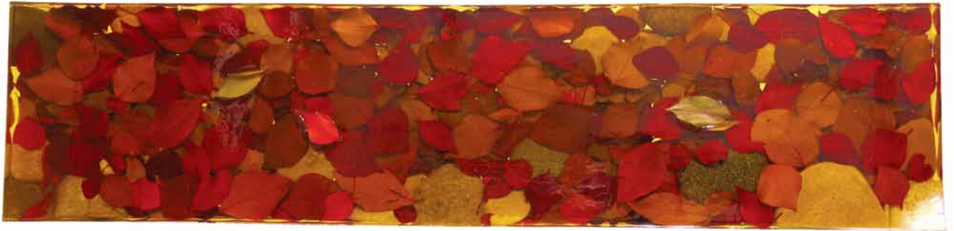
1 Autumn Leaves 11006 clear resin & autumn leaves 24 x 120 x 5 cm