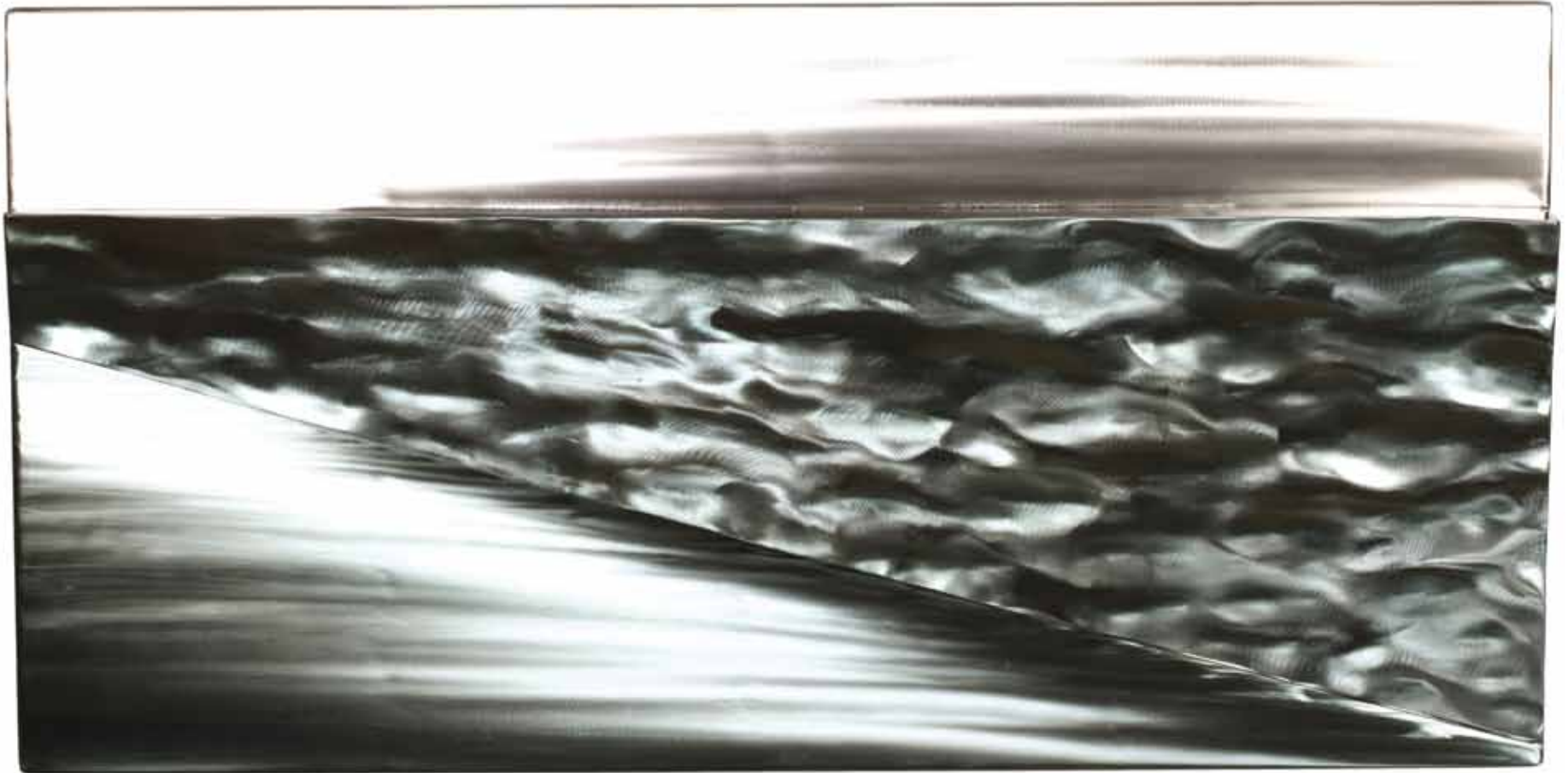
5 Immersion 11003 stainless steel 46 x 90 x 12 cm