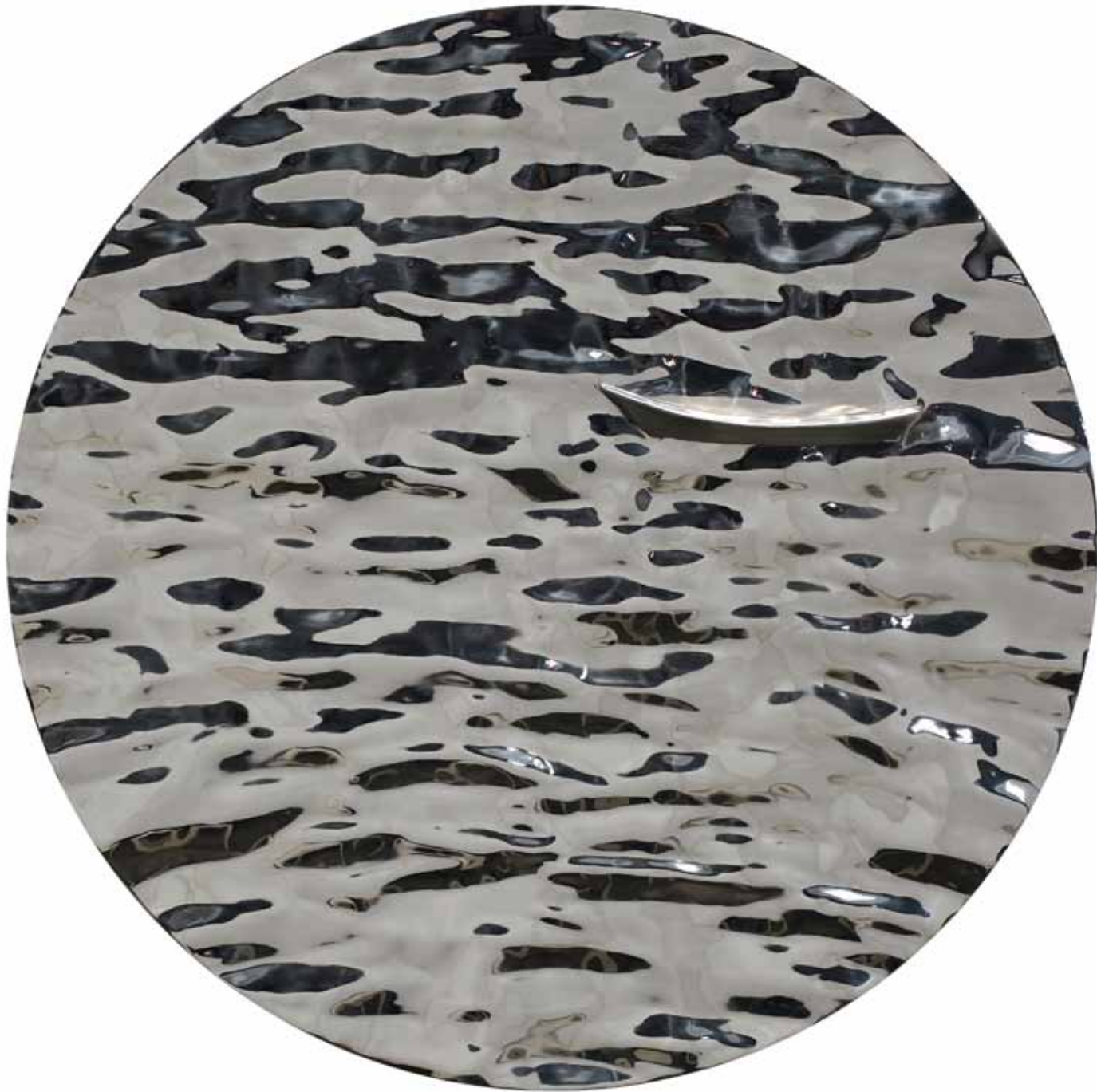
6 Voyage to the Light VII stainless steel 80 x 80 x 10 cm