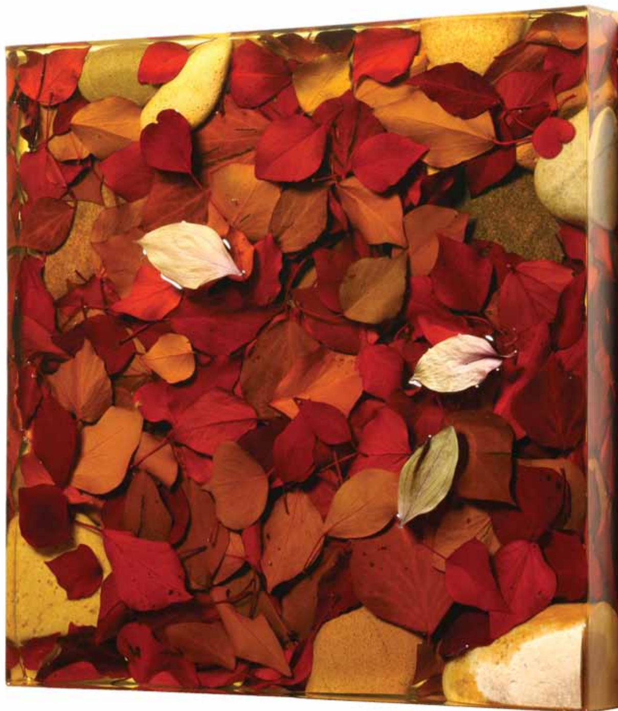
2 Autumn Leaves 11005 clear resin & autumn leaves 37 x 37 x 8 cm