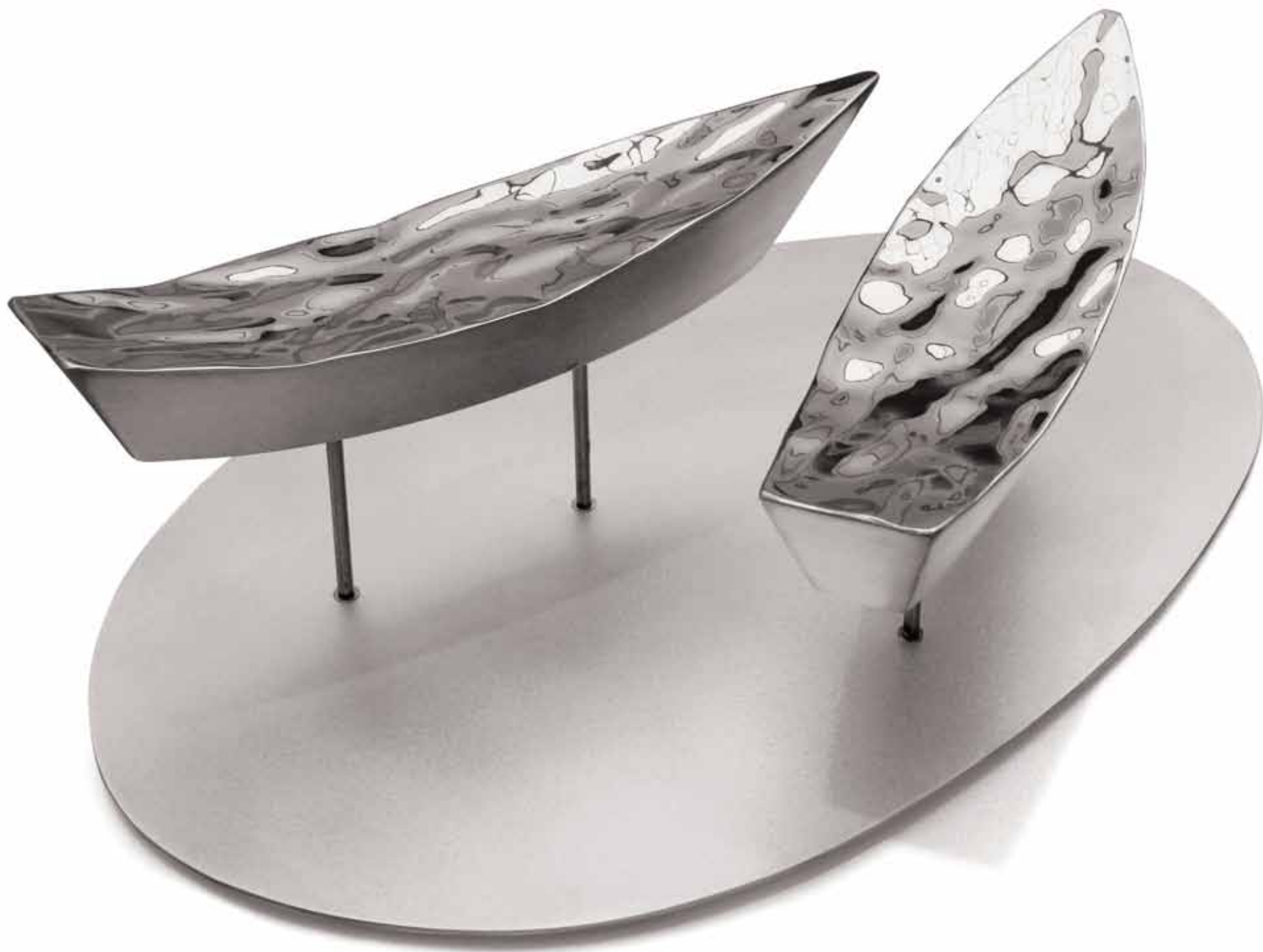
8 Voyage to the Light 11008 stainless steel 5 x 32 x 80 cm