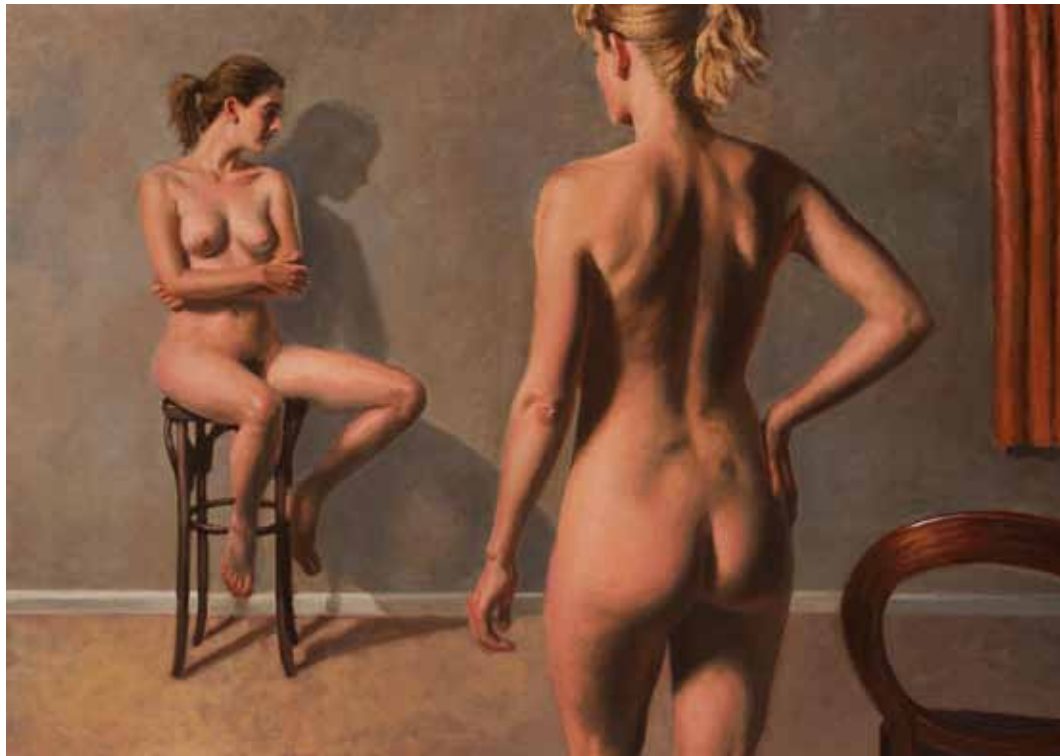
23 Life Room oil on canvas on panel 40 x 56 cm (16 x 22 in)