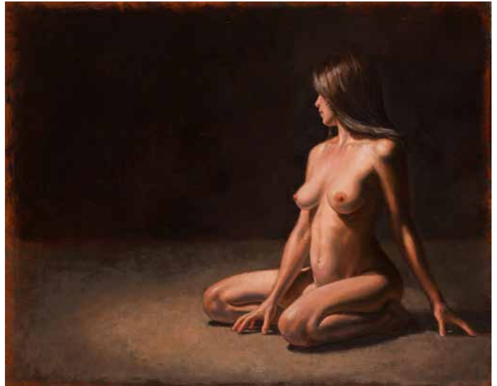
18 Model in Spotlight oil on canvas on panel 40 x 50 cm (16 x 20 in)