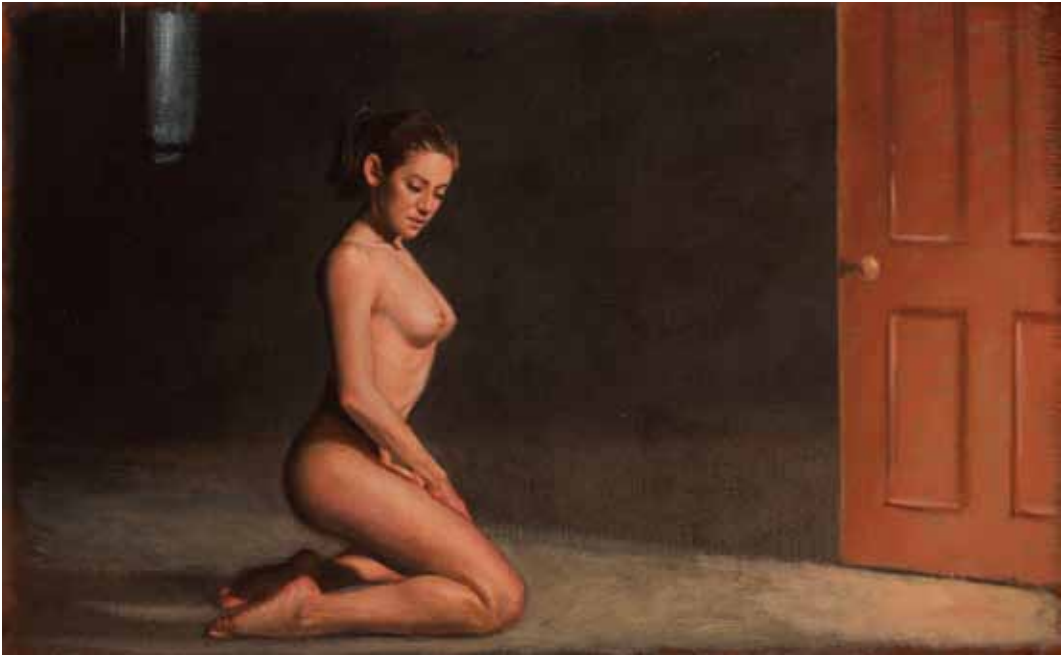
26 Kneeling oil on canvas on panel 38 x 60 cm (15 x 24 in)