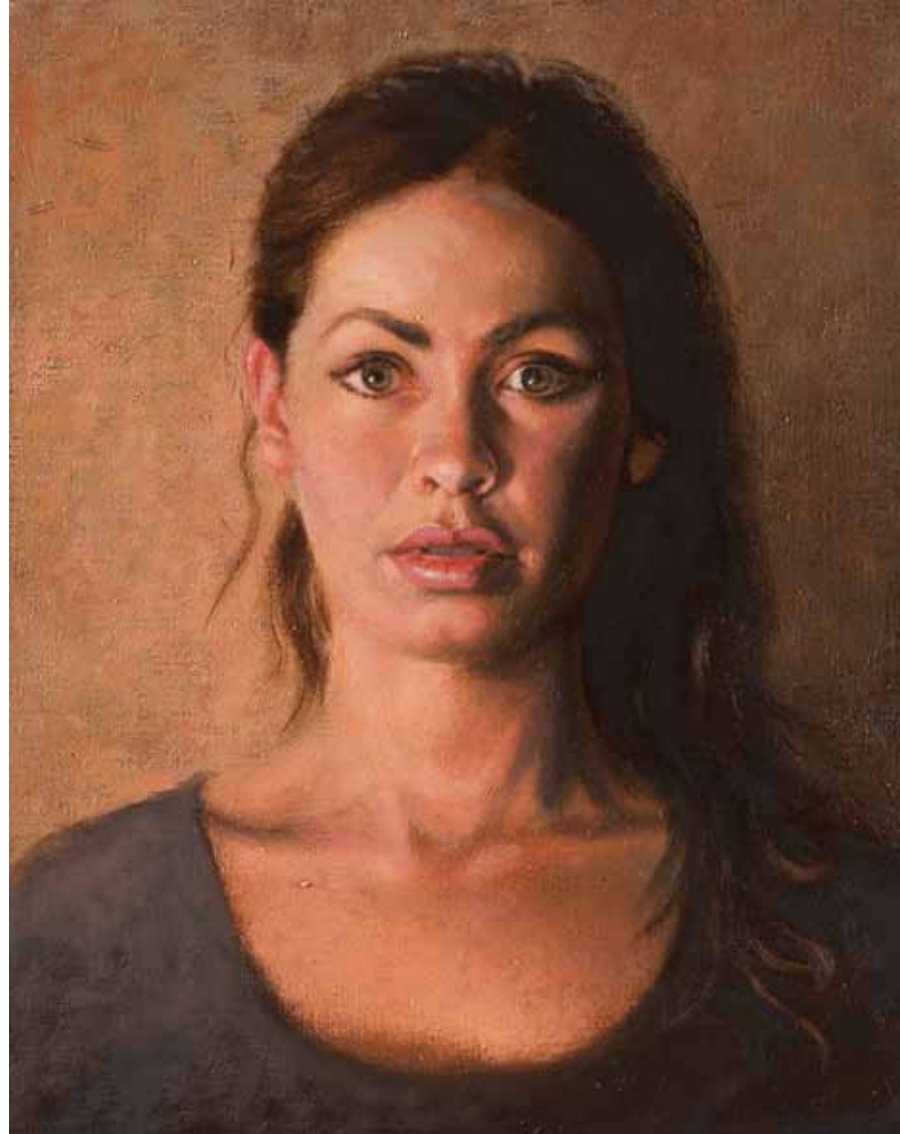
32 Hair to One Side (Head Study) oil on canvas on panel 30 x 24 cm (12 x 10 in)