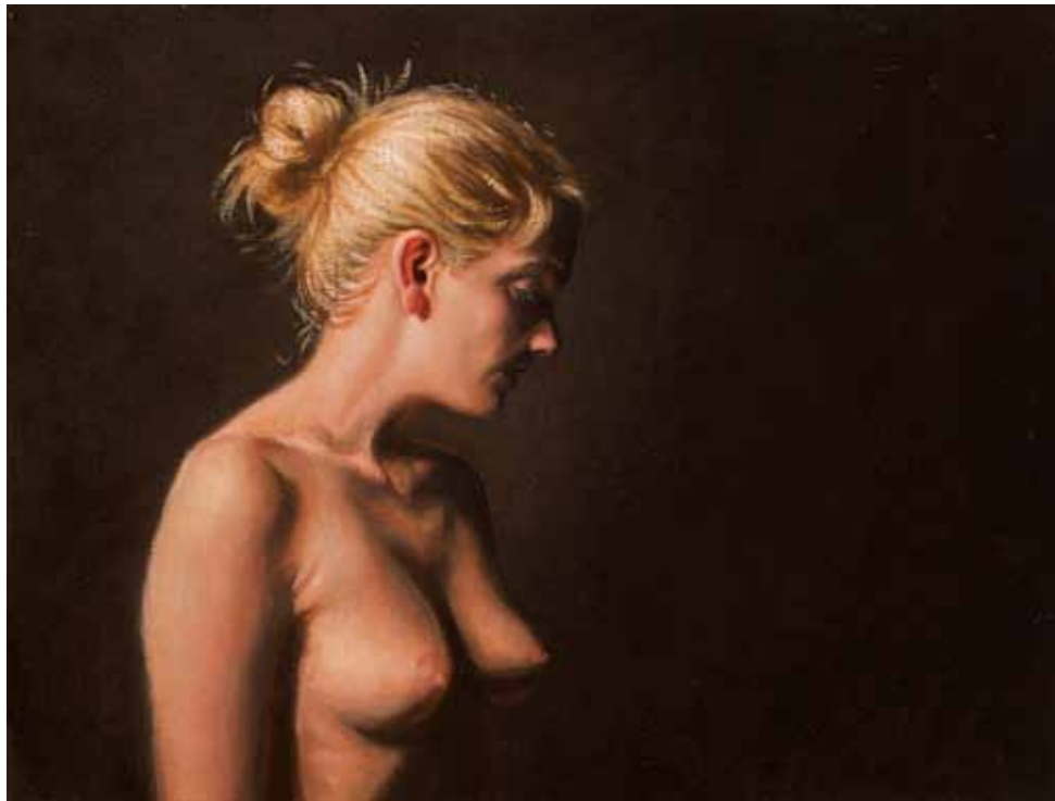
15 Model in Profile oil on canvas on panel 30 x 40 cm (12 x 16 in)