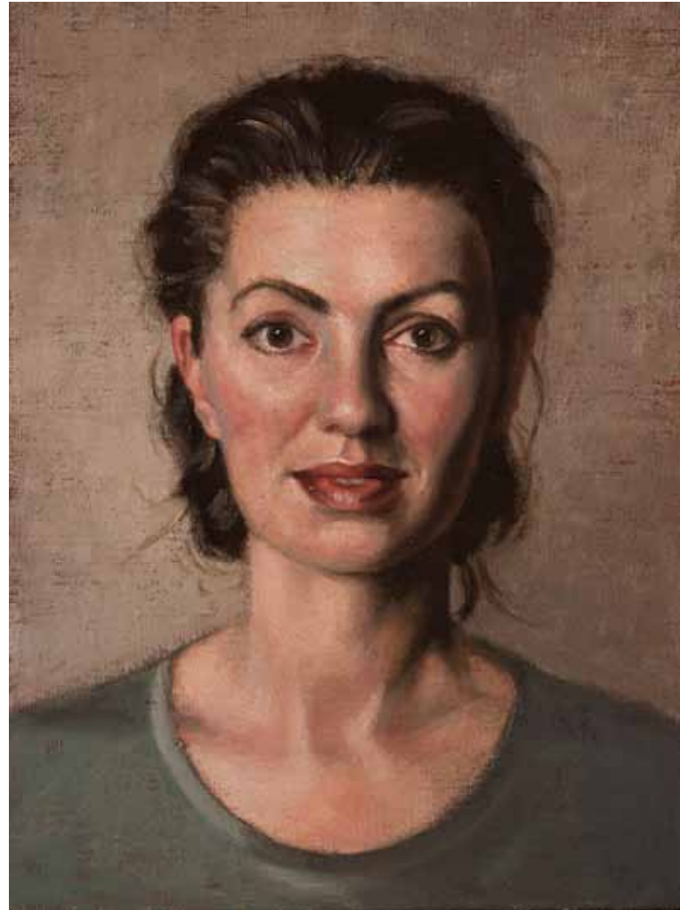
34 Green Top (Head Study) oil on canvas on panel 24 x 18 cm (9 x 7 in)