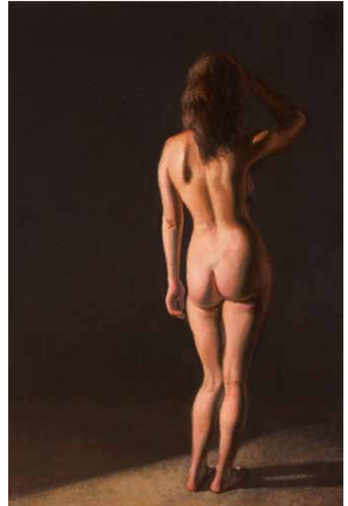
24 Model's Back oil on canvas on panel 45 x 30 cm (18 x 12 in)