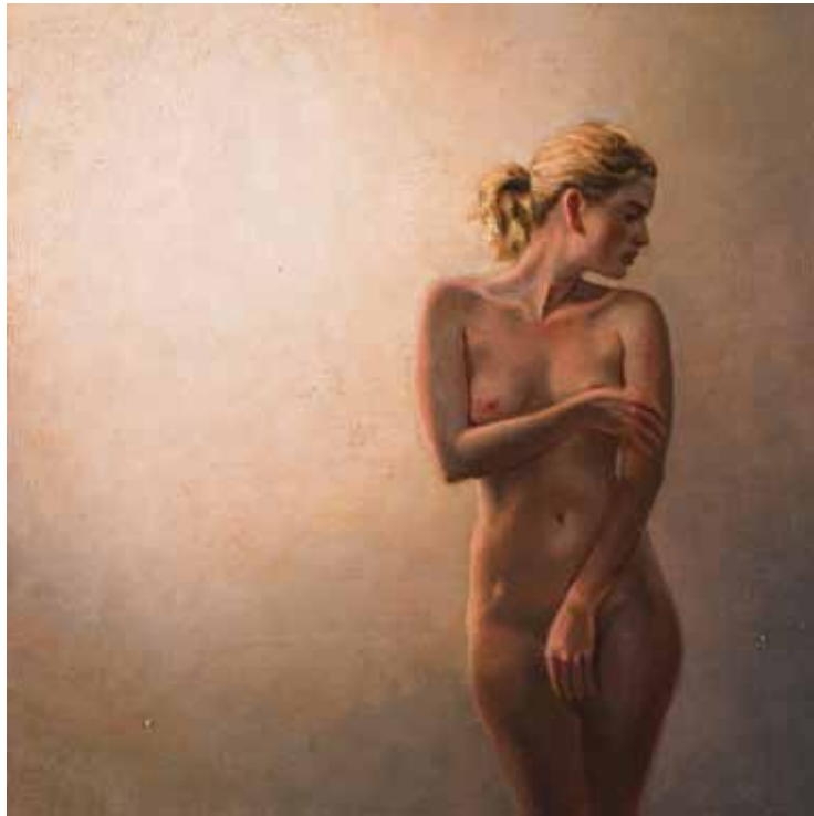
17 Venus oil on canvas on panel 30 x 30 cm (12 x 12 in)