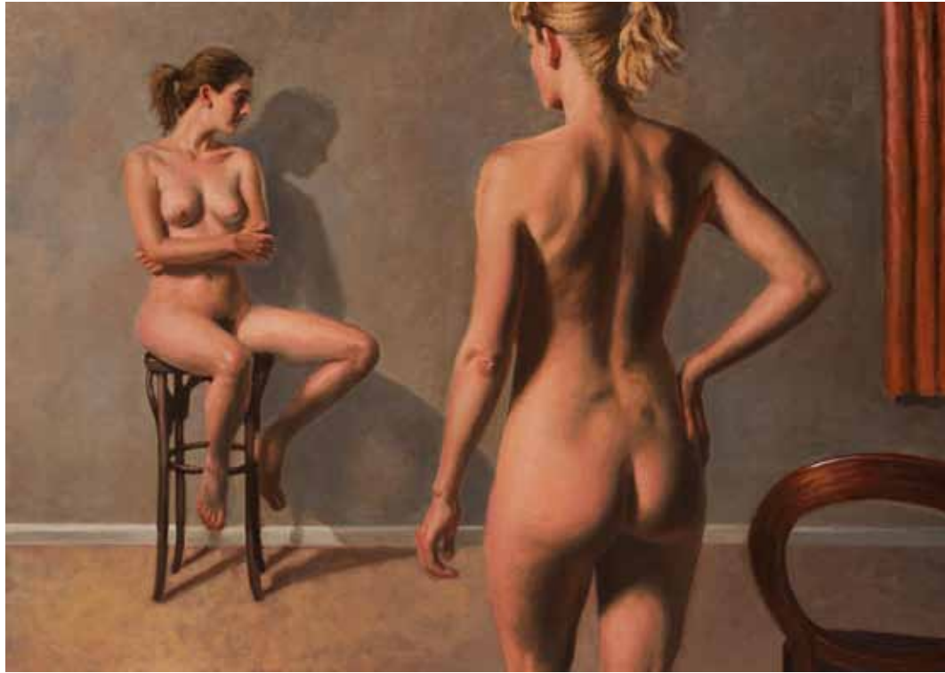
23 Life Room oil on canvas on panel 40 x 56 cm (16 x 22 in)