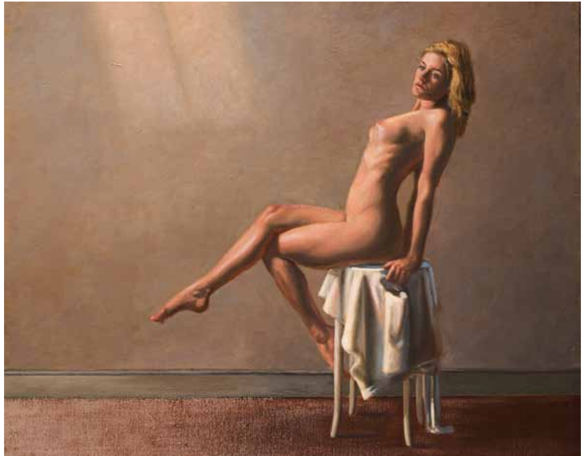
10 B-29 oil on canvas on panel 40 x 50 cm (16 x 20 in)