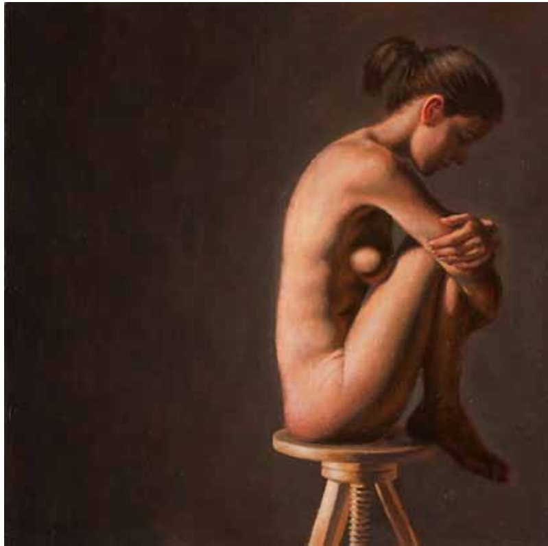
7 Wooden Stool oil on canvas on panel 30 x 30 cm (12 x 12 in)