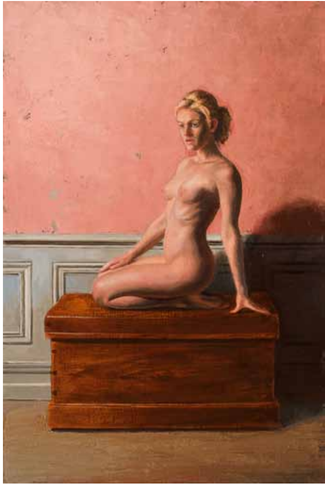
25 1940's Pose oil on canvas on panel 45 x 30 cm (18 x 12 in)