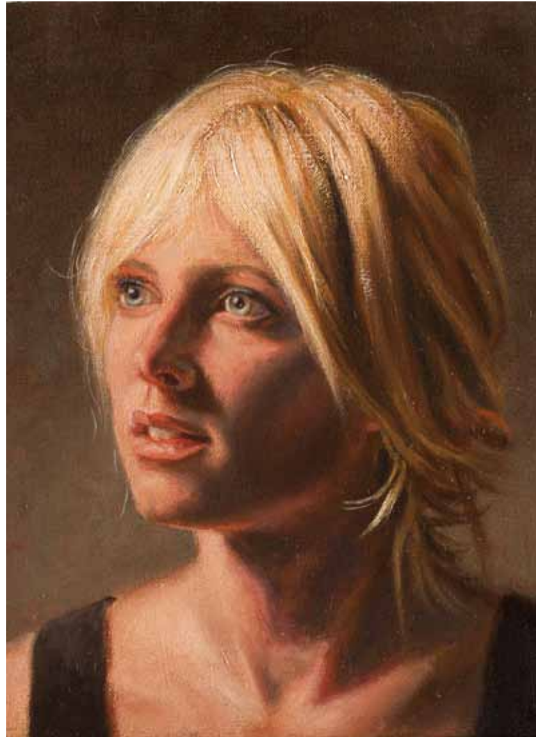
31 The Knight's Tale (Head Study) oil on canvas on panel 24 x 18 cm (10 x 7 in)